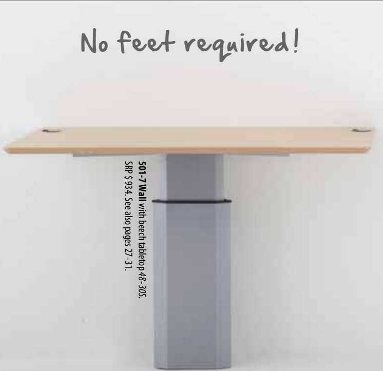
501-7 Wall with beech tabletop 48-305, SRP $ 934. See also pages 27-31.

Stylish, functional and lots of leg-space