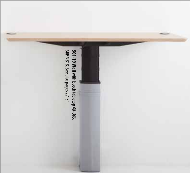
501-19 Wall with beech tabletop 48-305, SRP $ 818. See also pages 27-31.

Stylish, functional and lots of leg-space