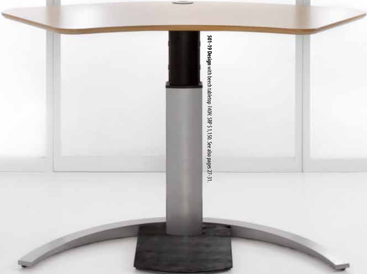
501-19 Design with beech tabletop 1400, SRP $1,150. See also pages 27-31.

Design and functionality perfectly combined.