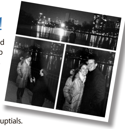
Article Submitted By: Reinhold Hutz

25th, 2017 for their wedding nuptials. Best wishes to the happy couple!