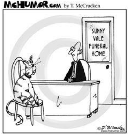
"I'd like to prearrange nine funerals."

The greatest gift you can give your loved ones at this difficult moment is to have all your arrangements made and wishes known to both your family and the church.