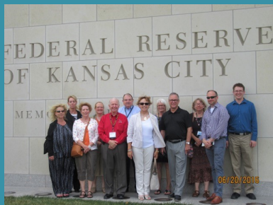
Nebraskans Tour Federal Reserve of Kansas City