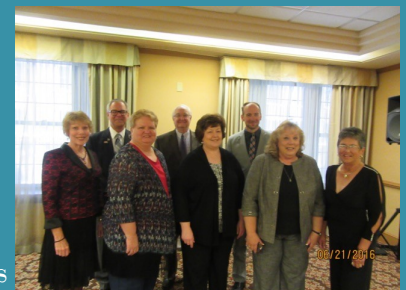
MPBEA Past Presidents