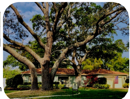
MAR—Majestic oak on Oakglen