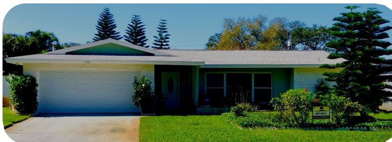
FEB—Special memory garden on Hillview