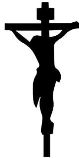
Text: African American spiritual