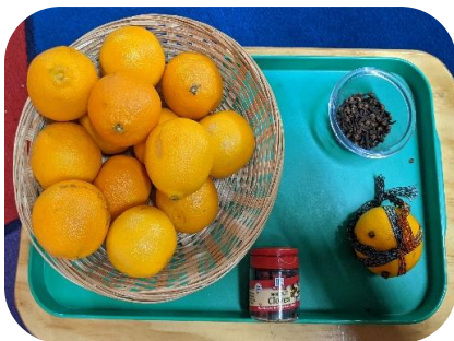
Clementine & Clove Ornament