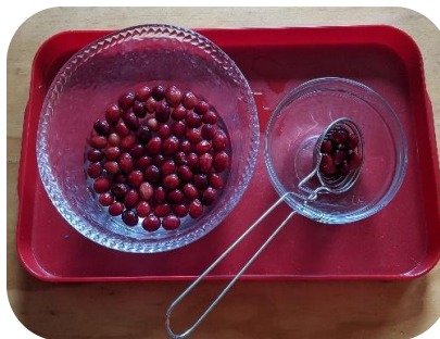
Cranberries in water scooping