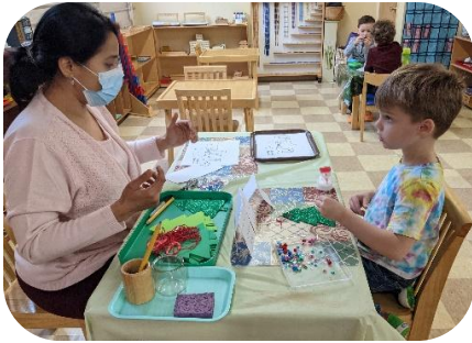
Tree Ornament Decorating