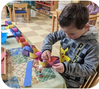
Paper Chain Garland