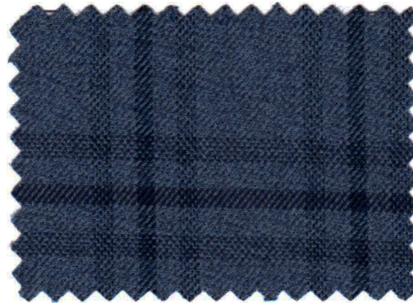
1266 Blue Plaid