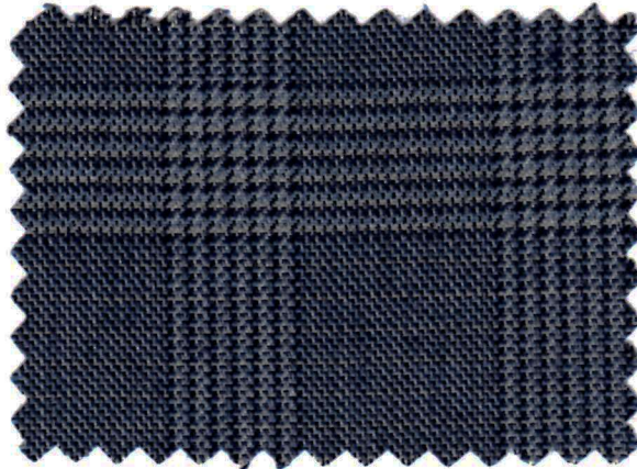
1263 Grey Plaid