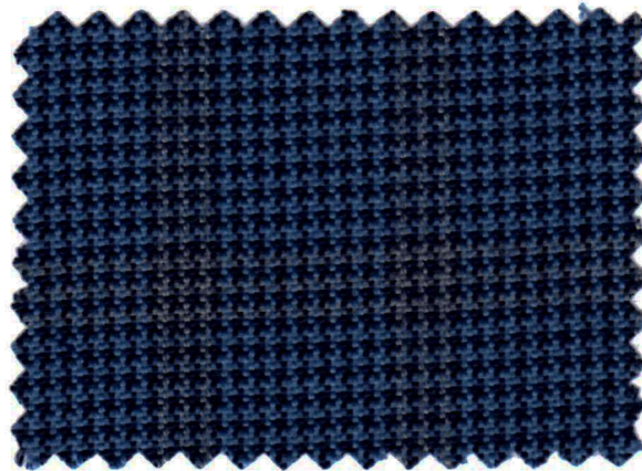
1262 Blue Check