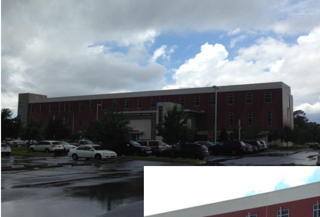
Courthouse EUL Adjacent Development