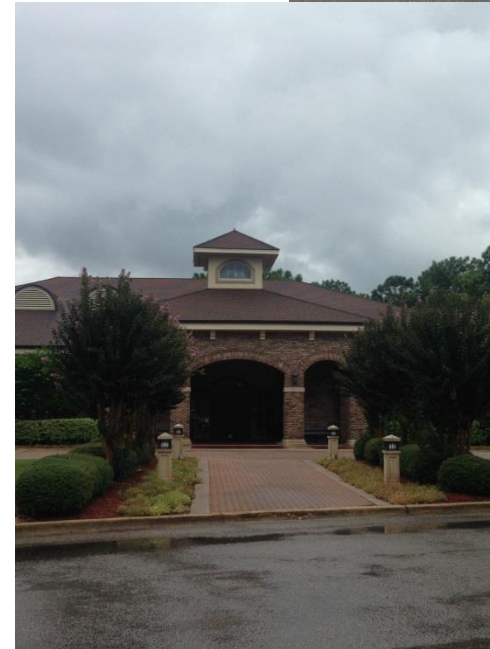
Across from Fort Walton Municipal Golf Course