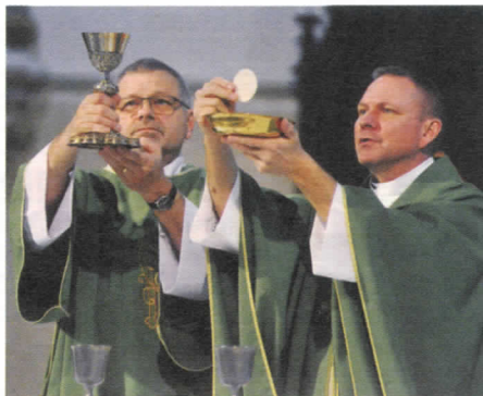
DEACON, AT LEFT

Deacons are vital to the life of the Church. Many permanent deacons have families and full-time jobs in addition to their Church work. We don't thank deacons and their families enough for the many sacrifices they make for the people of God.