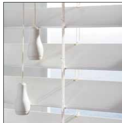
Exclusive light blocking feature