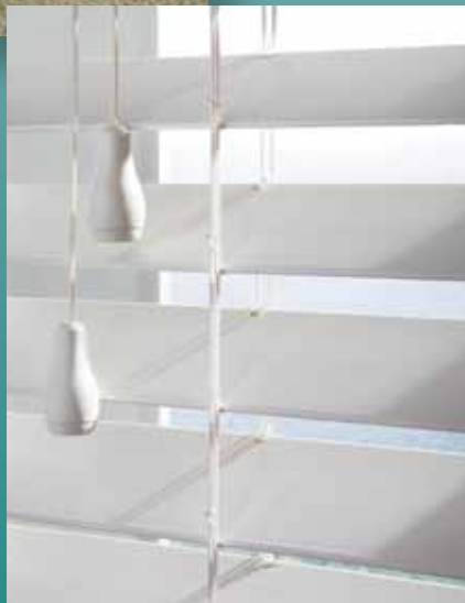
Hidden rout holes for privacy