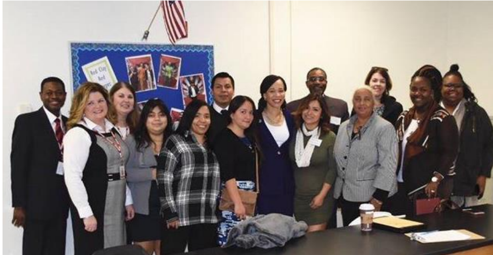
Red Clay students and staff with Congresswoman Lisa Blunt Rochester

After the Congresswoman left, the students, visitors and staff were overwhelmed with how warm, inviting and motivating the visit was. Some students have had a renewed excitement toward their studies, some want to read the Congresswoman's book, but all were thrilled to have such an important person take time for them and our school.