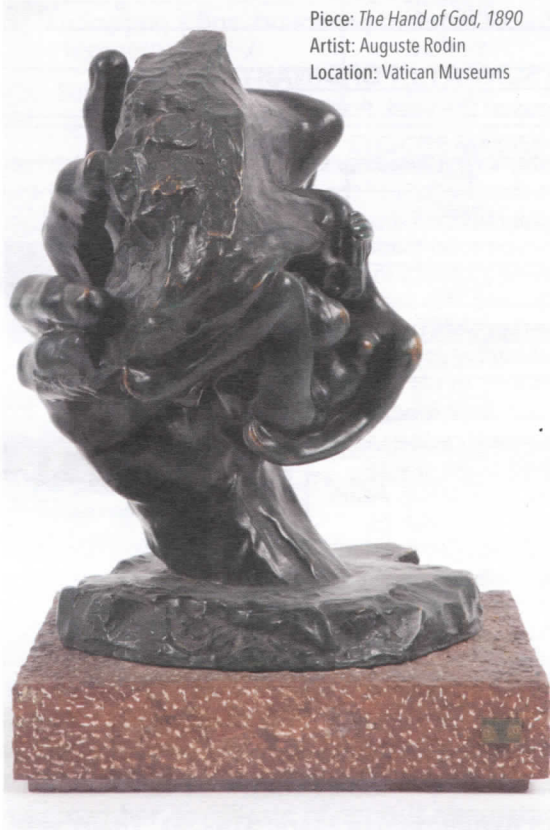
Piece: The Hand of God , 1890 Artist: Auguste Rodin Location: Vatican Museums

The Old Testament offers amazing tips on the