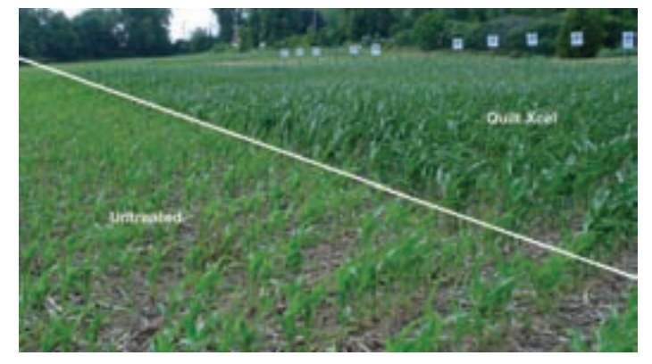
Quilt Xcel-treated corn (right) is visibly greener and experiencing more plant growth compared to untreated corn (left) across a variety of hybrid trials. Field located in Battle Creek, MI.