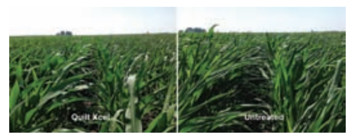
Quilt Xcel-treated corn (left) shows less leaf curling than untreated corn (right) in drought conditions. Field located in Grinnell, lowa.

Quilt Xcel® fungicide elevates corn to its full yield potential by shielding plants from stress, providing broad-spectrum disease control and offering physiological benefits from roots to ears. Quilt Xcel provides an 11-24 bu/A yield increase in corn, depending on application timing.