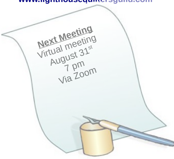
Newsletter Editors / Website Coordinators

Lighthouse Quilters Guild P. O. Box 081153 Racine, WI 53406-1153 www.lighthousequiltersguild.com