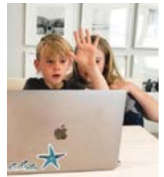
Far Right: First grade students had a live, online meeting with a ranger at Yellowstone National Park.