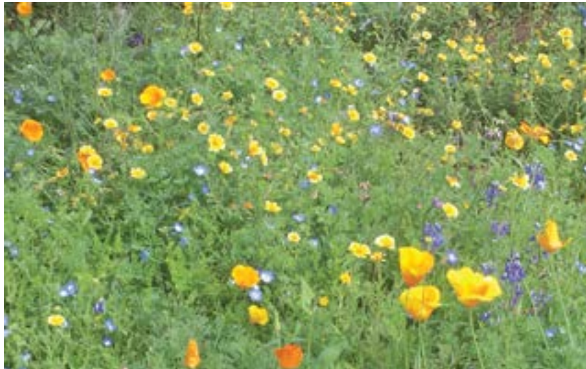
The wild flowers in the front yard.

the virus, I lived on my daily Dr. Peppers – yes, more than one. A day ago, I treated myself to a 12-ounce can of Coca-Cola. It tasted delicious, but I have no more insane craving for another.