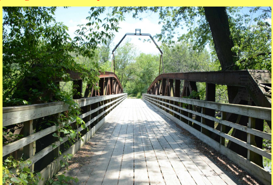
Once again with some confidence we can hit the road and cross the bridges for adventures

The Board strongly encourages that any participants in group activities and events be aware of and follow all recommended Federal, State, and County orders, as well as continuing to follow the guidance of public health experts and make decisions that are in line with safety measures and precautions regarding the COVID-19 pandemic.