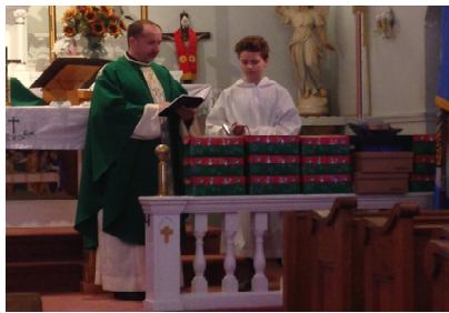
Blessing of the Shoeboxes — Nov 18th

In 2018 St. Casimir's PNCC once again participated in Operation Christmas Child by collecting shoebox gifts.