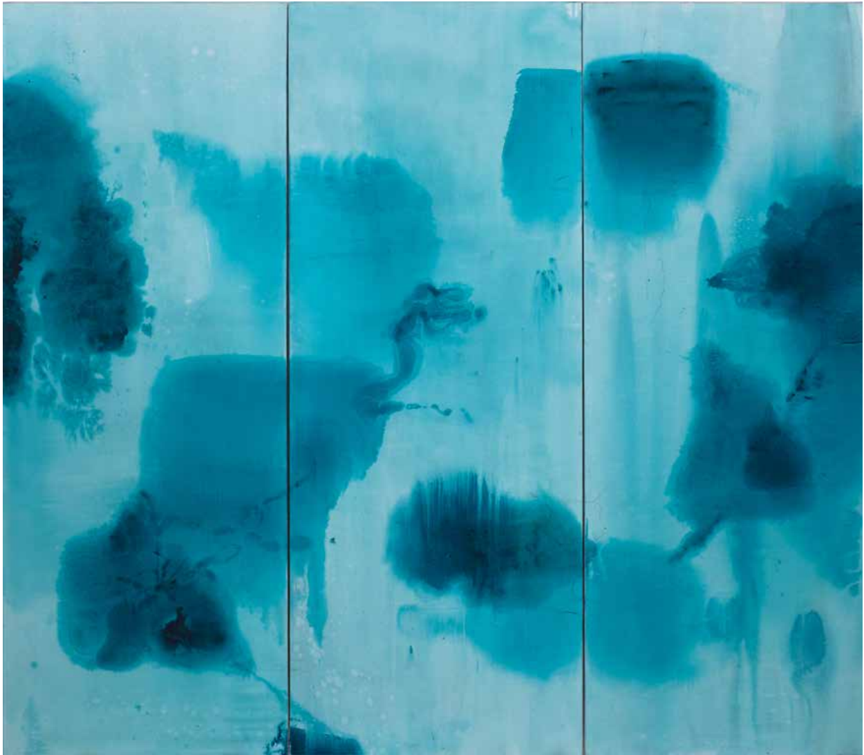
Triptych for RM, 2012 acrylic on canvas 99 x 102 inches