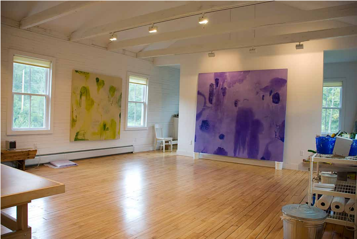
Studio, Rock Valley, NY 2010