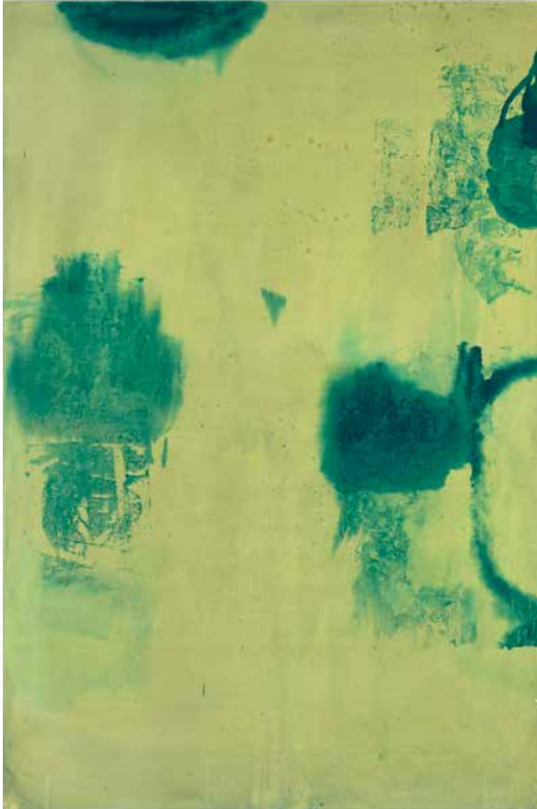
Rock Valley, 2014 acrylic on canvas 72 x 48 inches