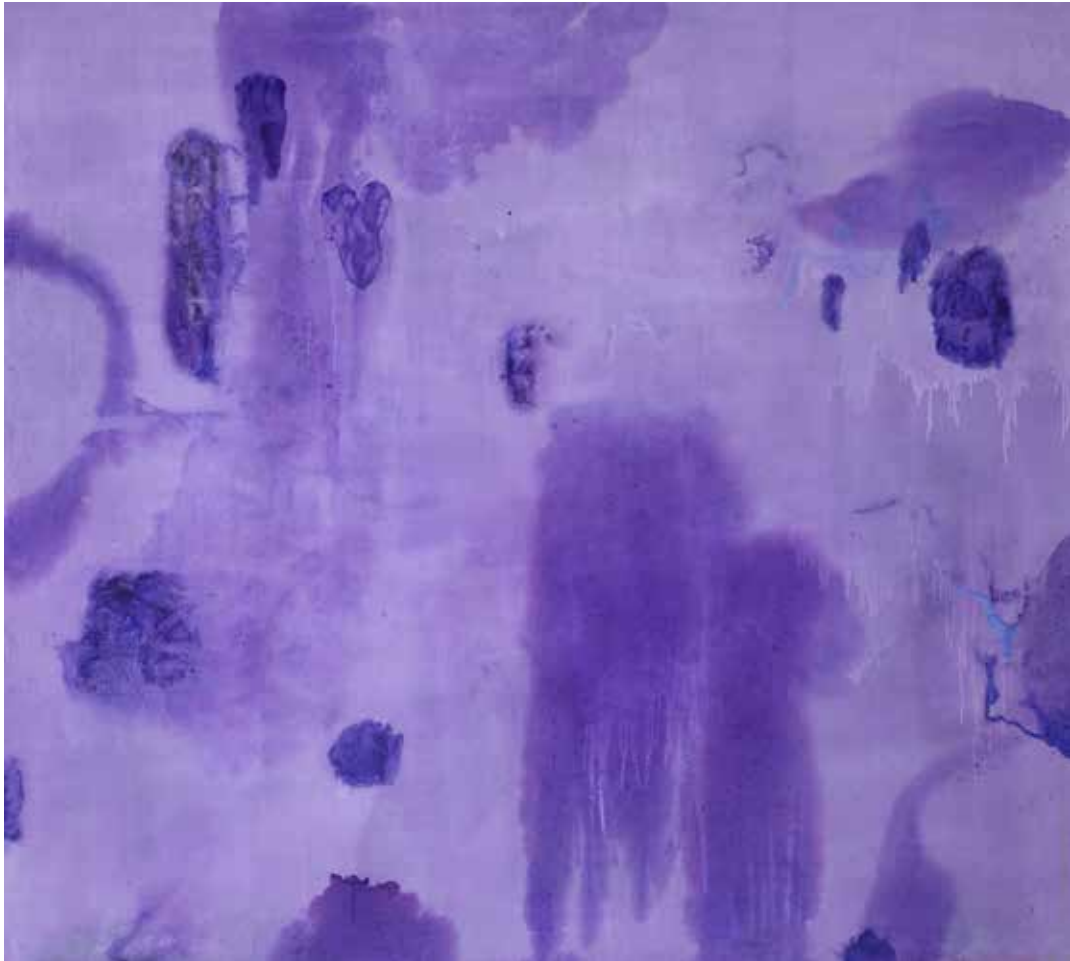
Purple Haze, 2010 acrylic on canvas 92 x 102 inches