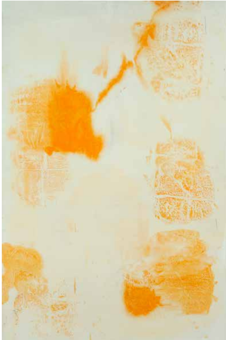
Orange / grey, 2015 acrylic on canvas 72 x 48 inches