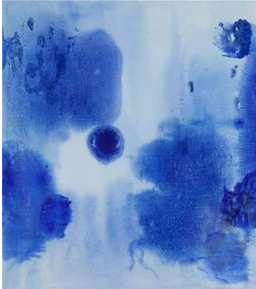
Blue Mood, 2013 acrylic on canvas 40 x 36 inches