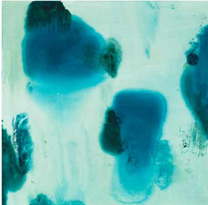
Next To, 2012 acrylic on canvas 36 x 36 inches