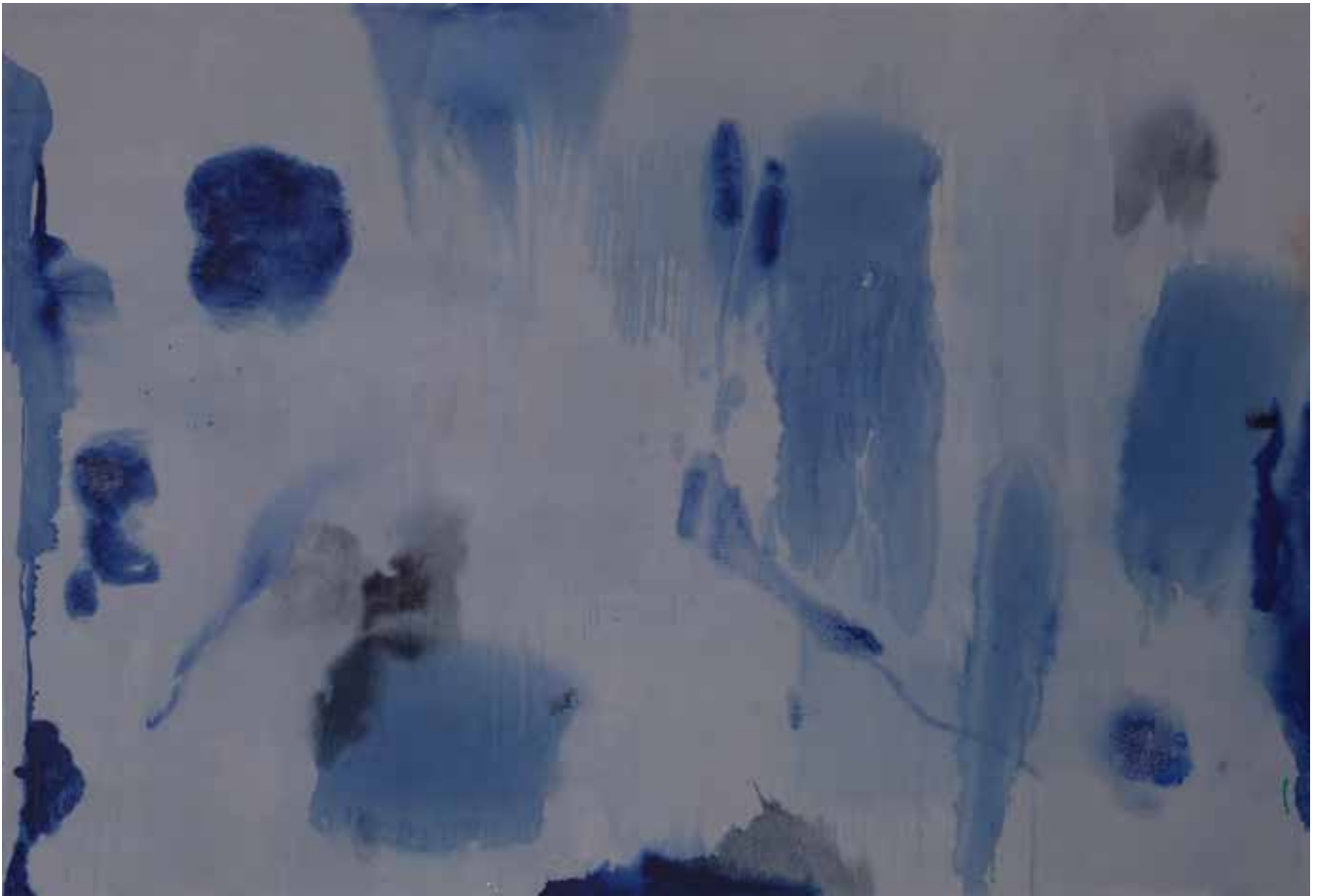
Night, 2010 acrylic on canvas 69 x 106 inches