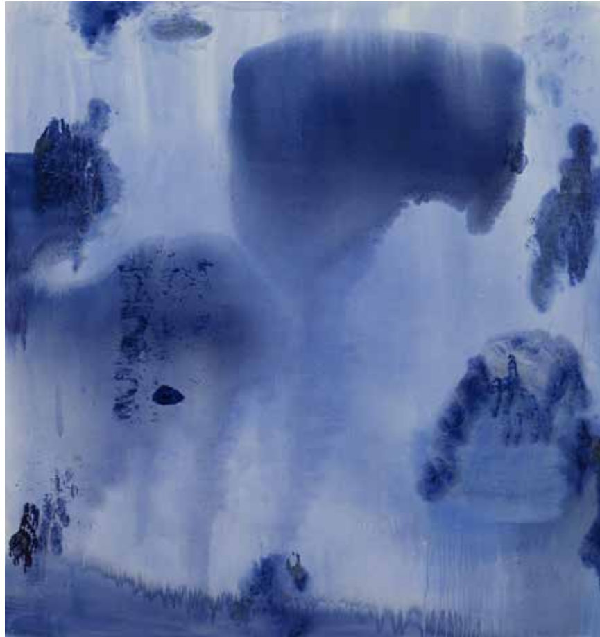
Realm, 2013 acrylic on canvas 70 x 66 inches