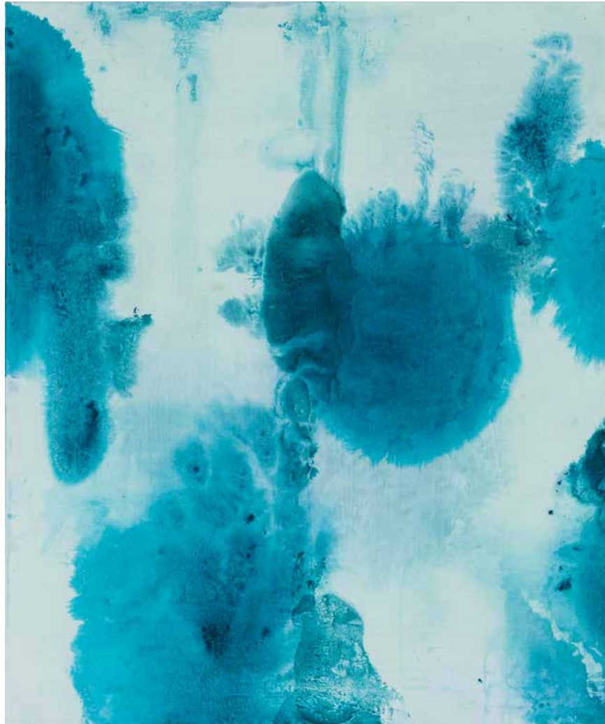
Freeze, 2012 acrylic on canvas 36 x 30 inches