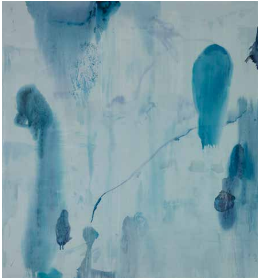
Teal Daylight, 2010 acrylic on canvas 68 x 63 inches