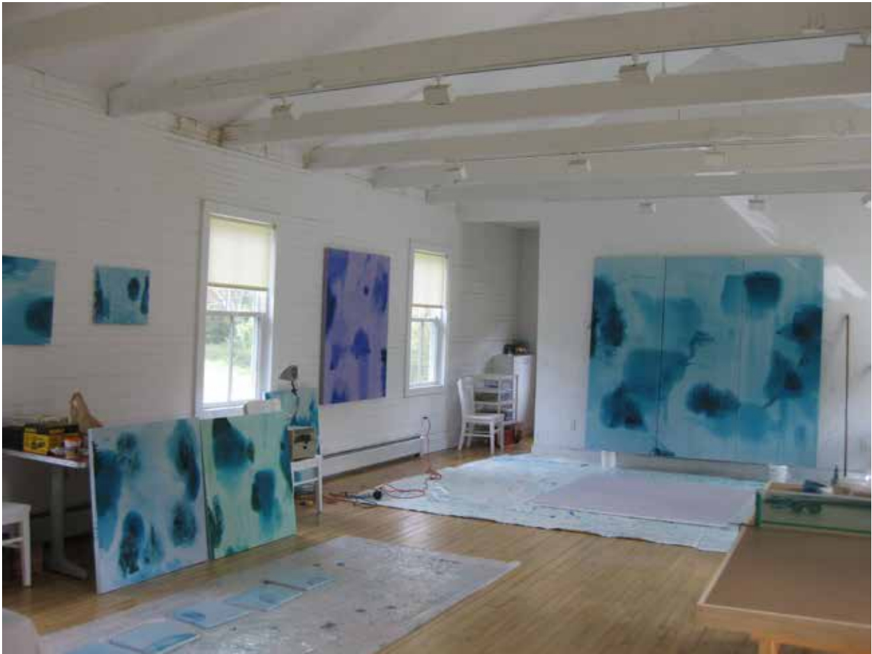
Studio, Rock Valley, NY 2013