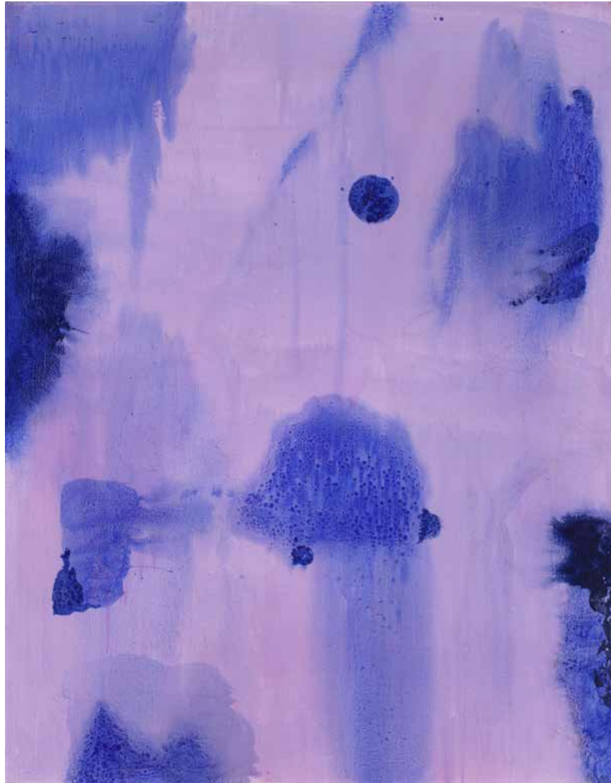
Under and Over, 2012 acrylic on canvas 60 x 47 inches