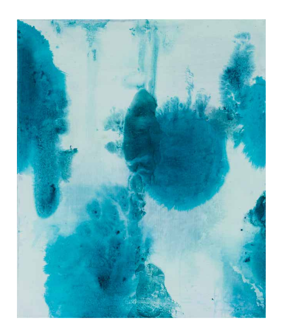
Freeze, 2012 acrylic on canvas 36 x 30 inches