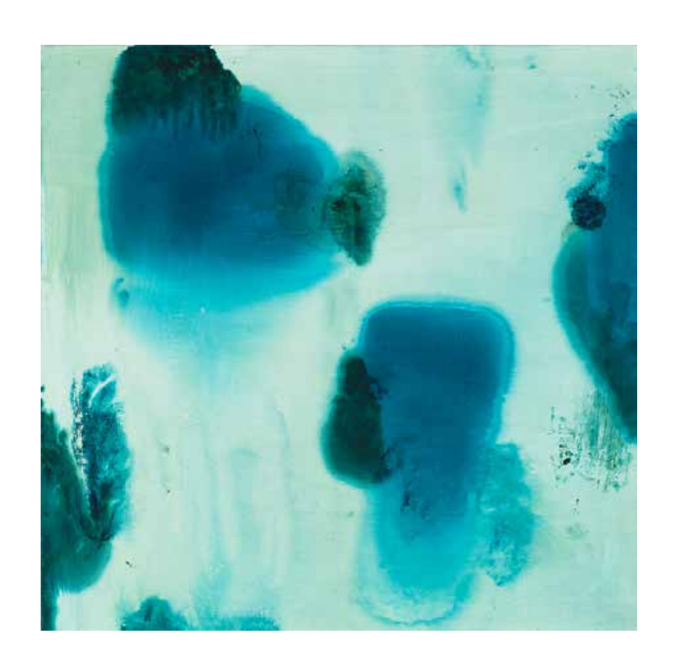
Next To, 2012 acrylic on canvas 36 x 36 inches