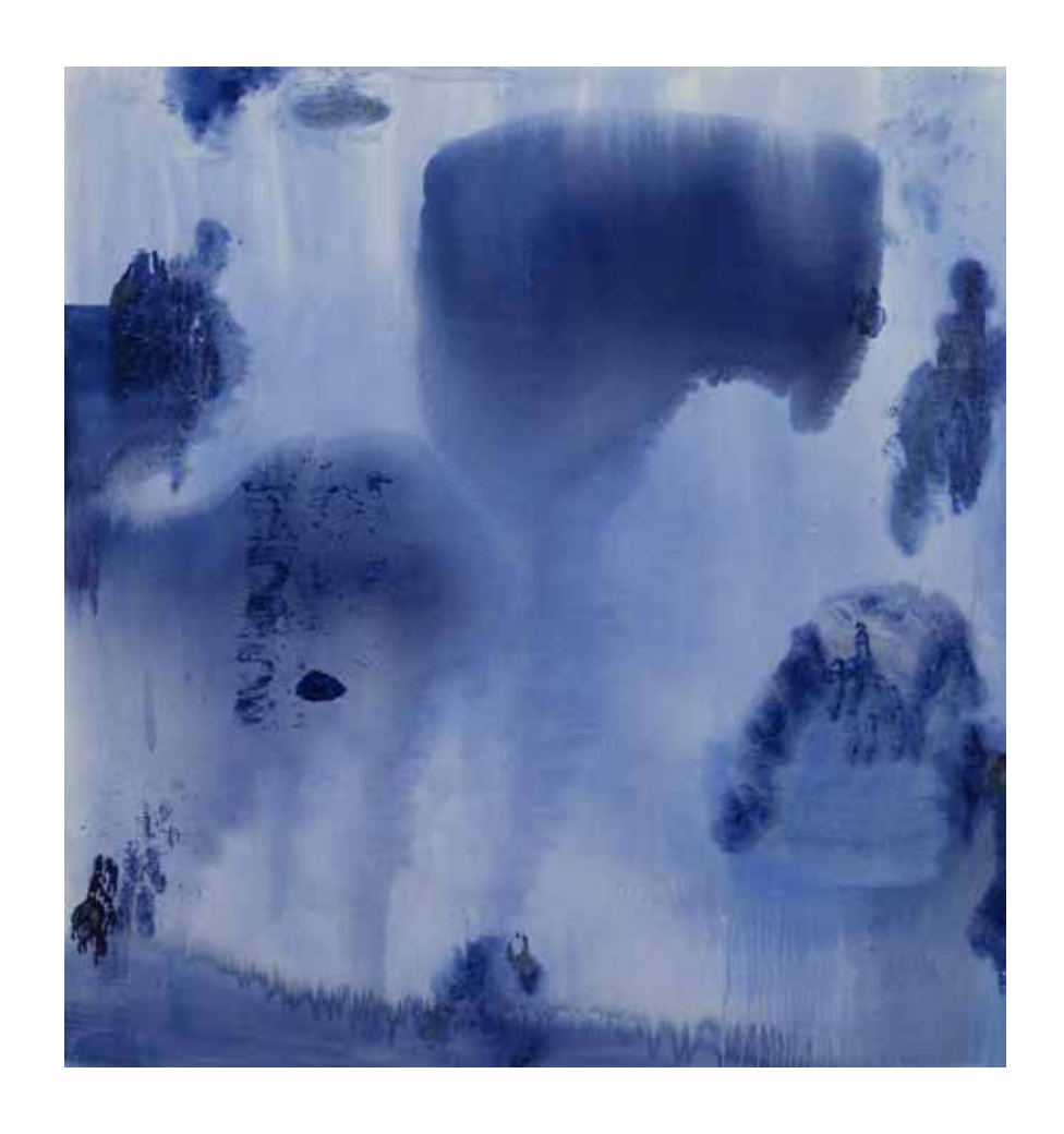
Realm, 2013 acrylic on canvas 70 x 66 inches