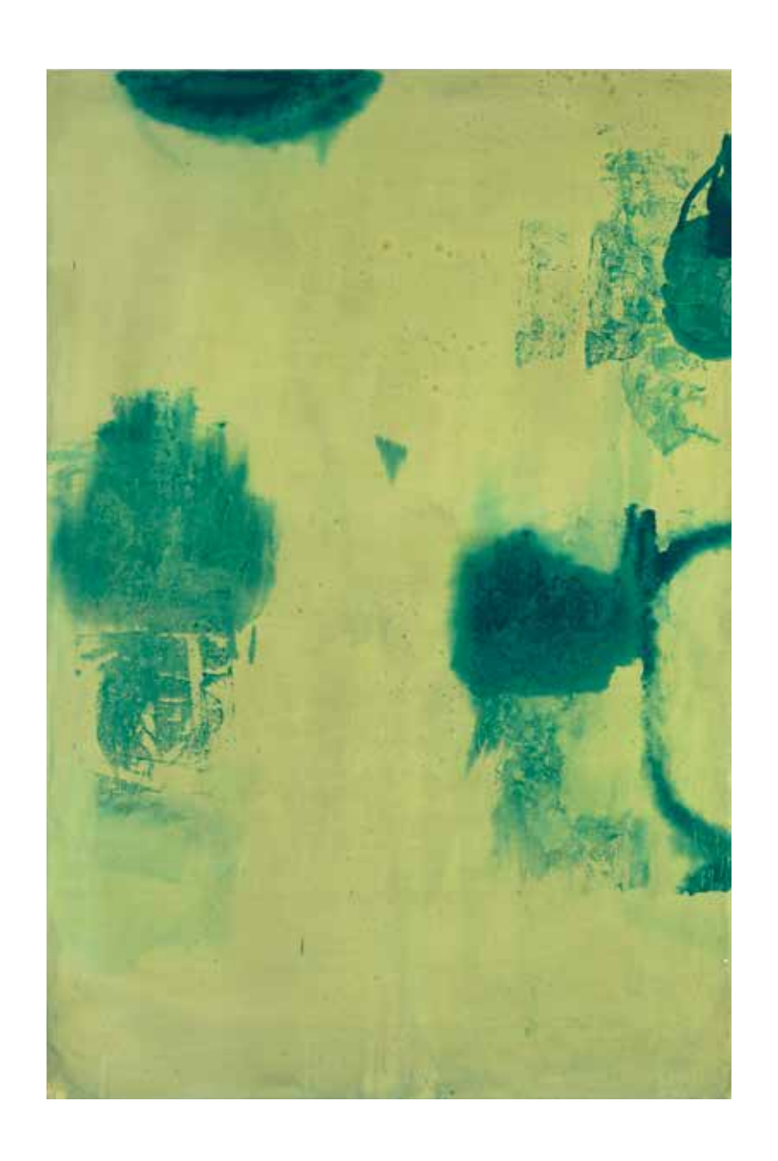
Rock Valley, 2014 acrylic on canvas 72 x 48 inches