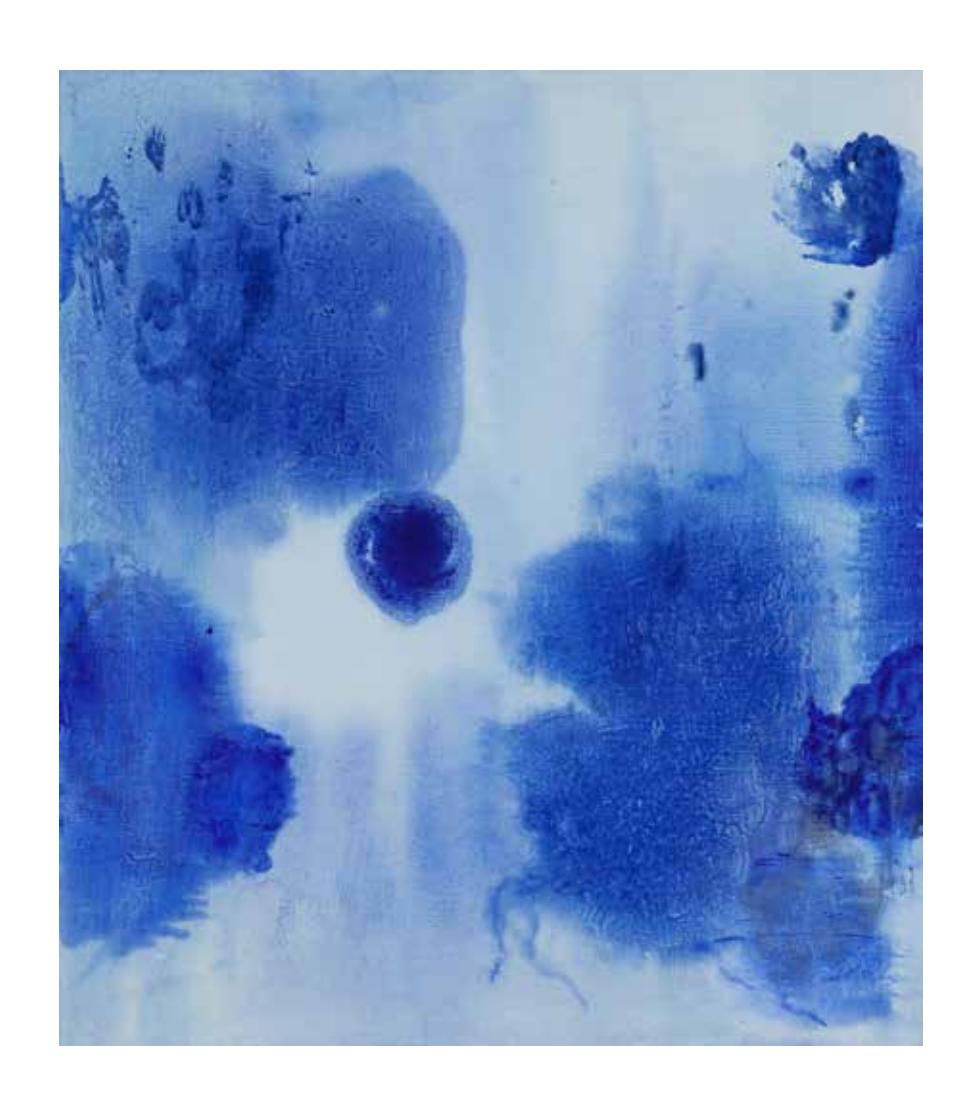
Blue Mood, 2013 acrylic on canvas 40 x 36 inches