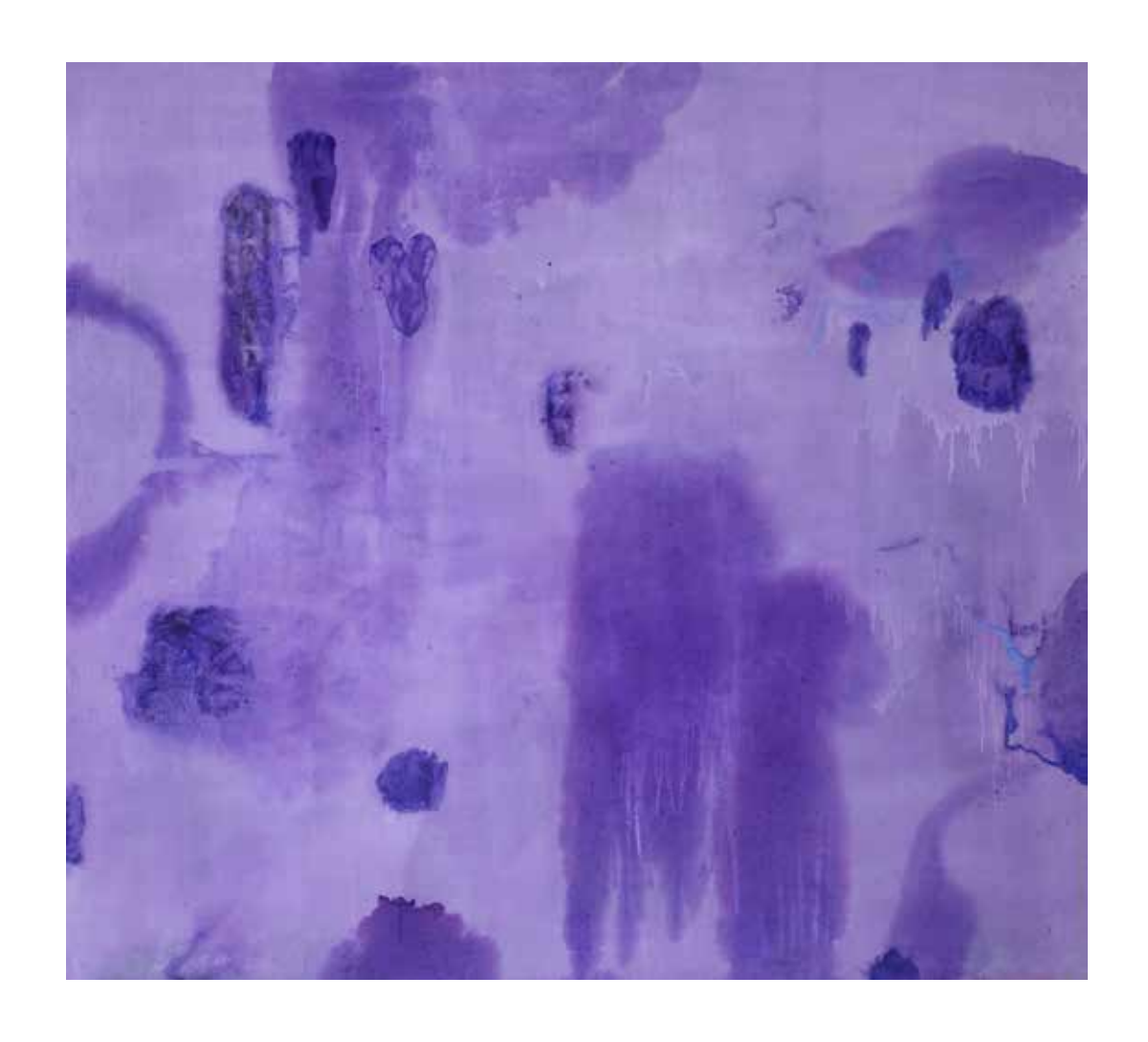
Purple Haze, 2010 acrylic on canvas 92 x 102 inches