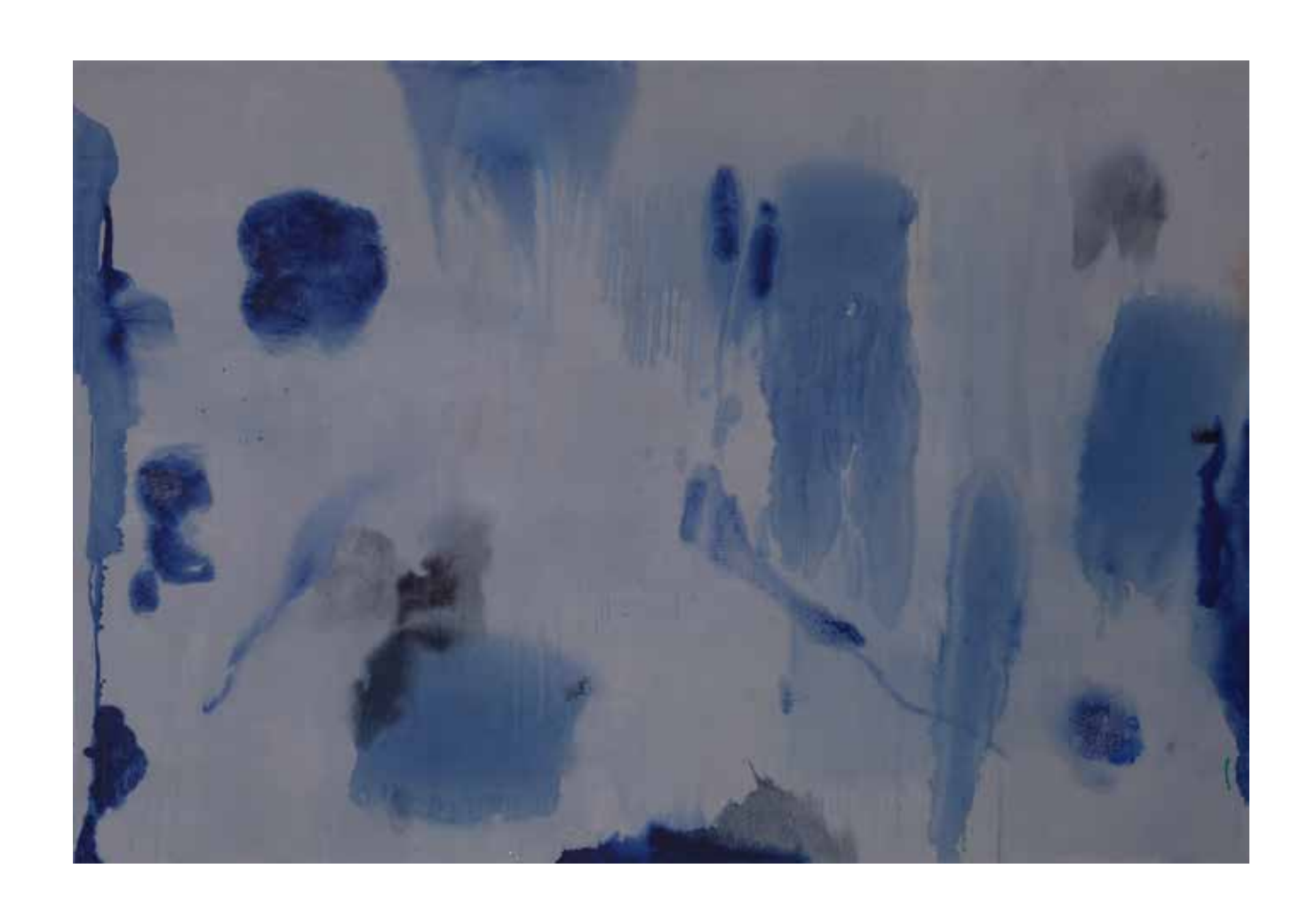
Night, 2010 acrylic on canvas 69 x 106 inches