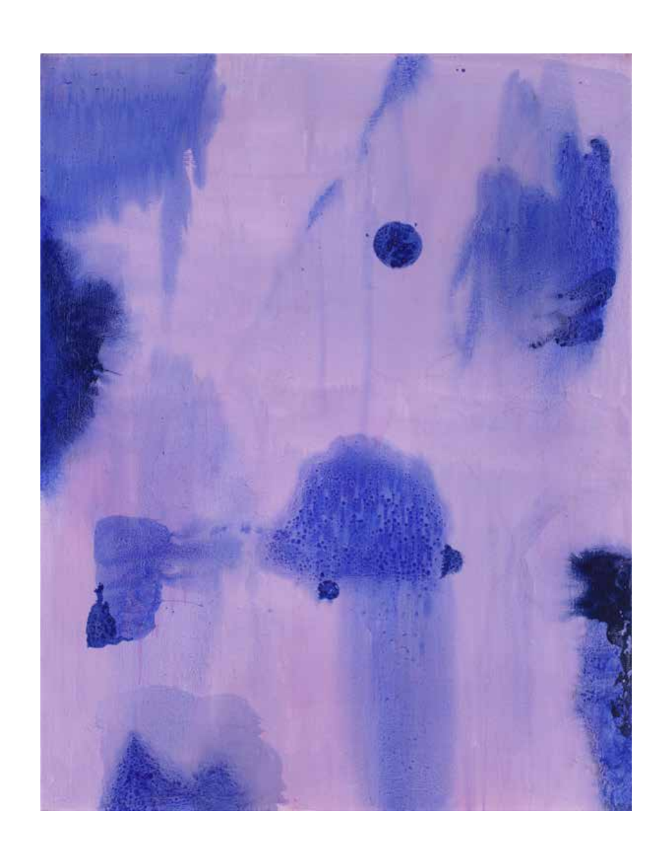
Under and Over, 2012 acrylic on canvas 60 x 47 inches