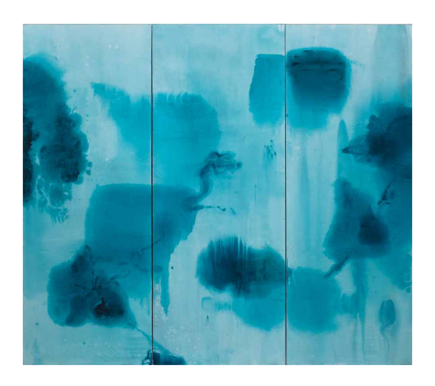
Triptych for RM, 2012 acrylic on canvas 99 x 102 inches