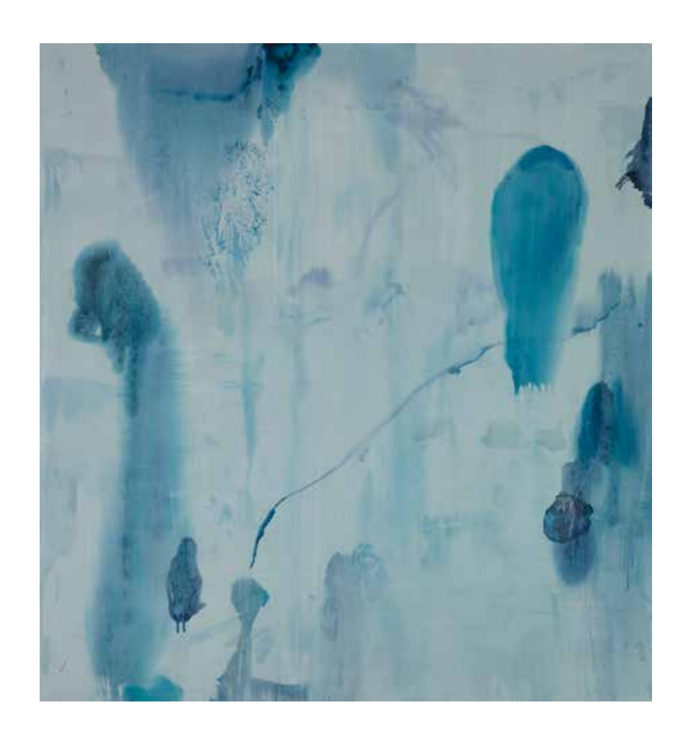
Teal Daylight, 2010 acrylic on canvas 68 x 63 inches