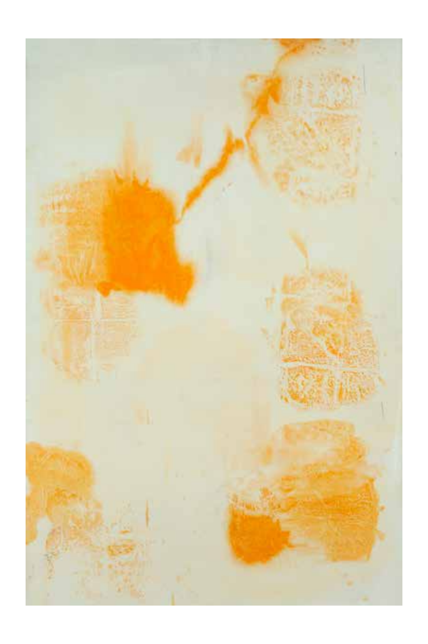
Orange / grey, 2015 acrylic on canvas 72 x 48 inches