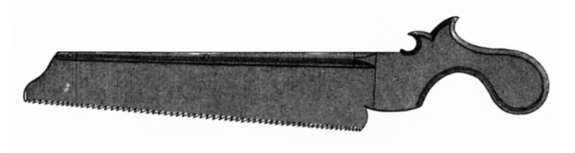
A surgeon's amputation saw

Aboard naval vessels the potential for serious wounds was, naturally, much greater than in the merchant service, but severity was a common denominator. It mattered little if a falling spar was shot down or broken by a storm when it crushed a man, or if a declared enemy or a pirate fired the cannon shot. The consequences of such an injury were often beyond the skill of the seaman's companions to deal with effectively with any hope of cure. In many instances, attempts to save a life required amputations, which were then performed without anesthesia, sometimes resorting to the ship's carpenter's saw.