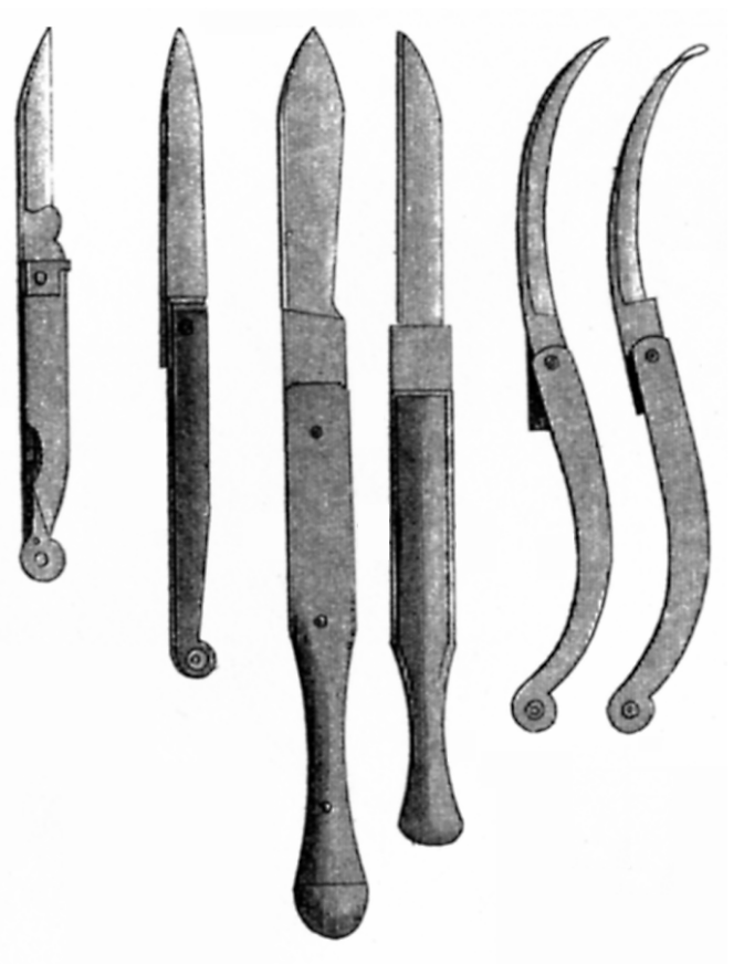
Assorted surgeons' scalpels

proper nursing, lodging, and diet. If these cannot be had, or are not furnished on board the vessel, he is entitled to be taken on shore to a hospital, or to some place where these can be He obtained is entitled to be put on shore if his disease requires it; it is seldom that proper care can be taken of a seaman on board ship."<sup>9</sup>