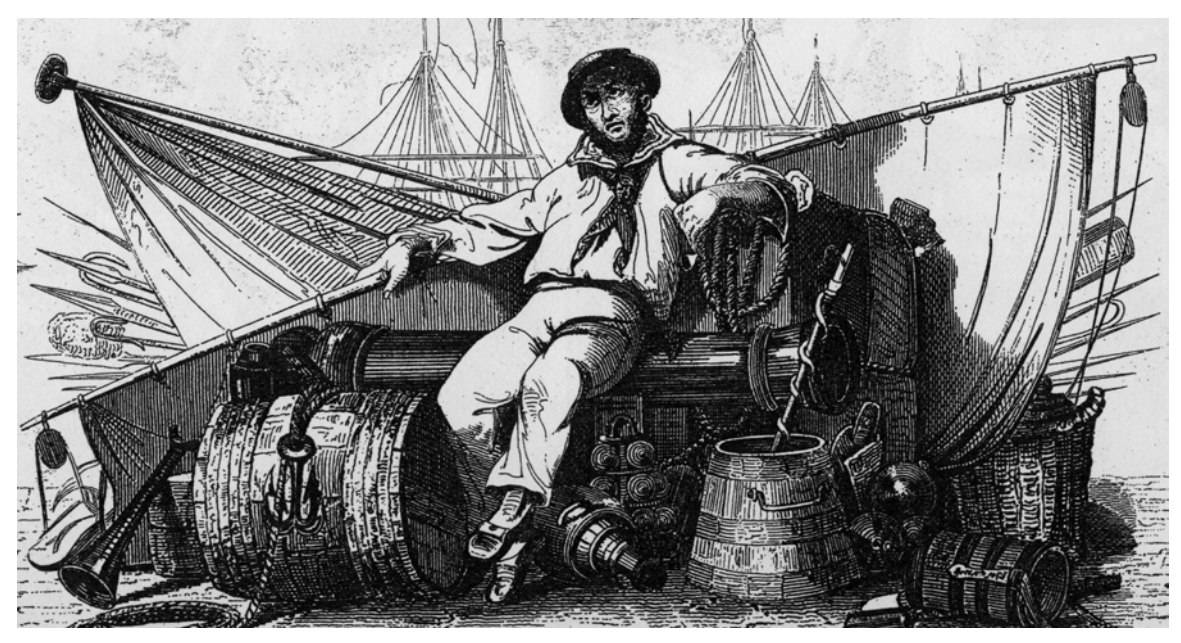
A 19<sup>th</sup> century engraving of a seaman and some tools of his trade

Incidents ashore caused, hopefully, only minor injuries resulting from drunkenness and cases of venereal diseases that required attention once back aboard ship.