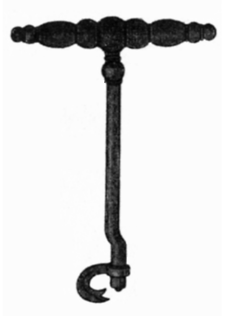
A 19<sup>th</sup> century tooth extractor

communicable diseases. Ships crawled and rats. with insects Filth accumulated in the bilges. Food stores were frequently rotten or infested with vermin. Fresh water went foul. The diet was monotonous and lacked vitamins necessary for maintaining good health. The work required physical dexterity and agility and could be exceptionally hazardous. Extended voyages to distant, often hostile climates provided even greater opportunities for mishap and disease.