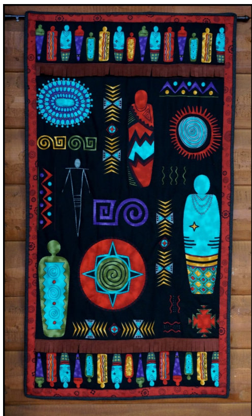
Peggie Fink made a beautiful, intricately quilted wall hanging to donate for the auction