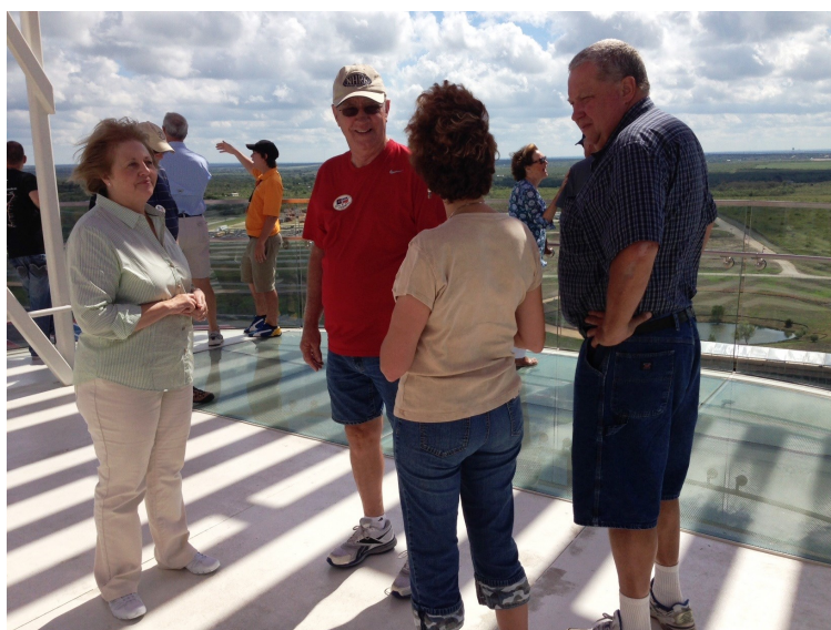
Touring the Circuit of Americas Race Track and the Texas Hill Country Olive Company Factory and Store