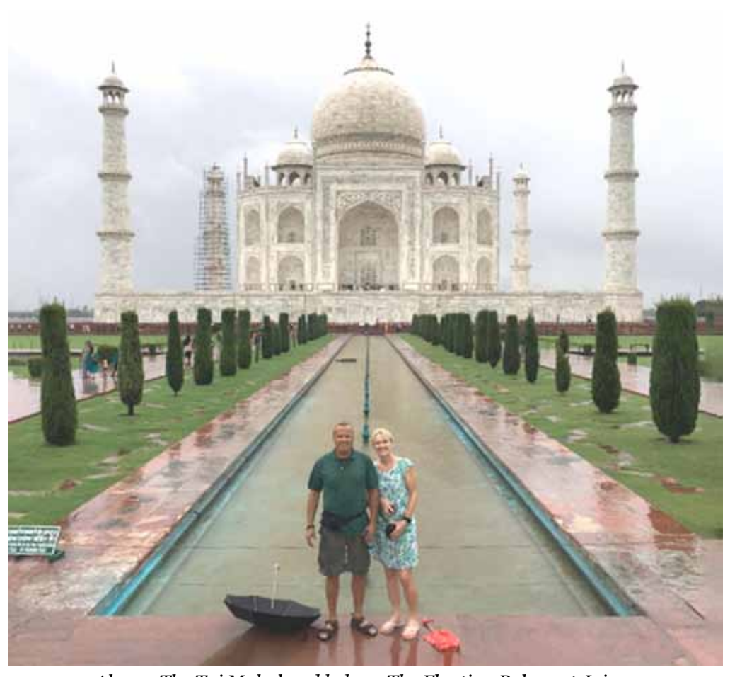
Above: The Taj Mahal and below: The Floating Palace at Jaipur