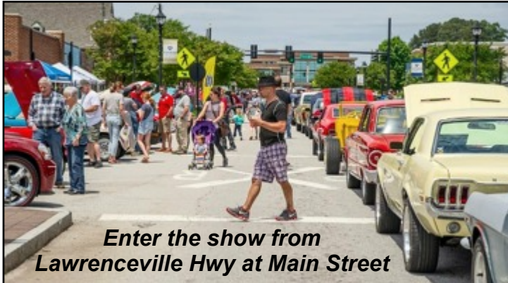
Enter the show from Lawrenceville Hwy at Main Street

Saturday, June 10th 10:00 am - 2:00 pm DOWNTOWN TUCKER on Main Street Tucker, GA 30084