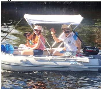
The Prizlees head to their assigned canal