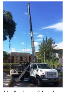
The City's pontoon boat served as a mother ship, to pick up debris collected by the boats & kayaks. Then the City's truck hoisted the load by crane. This system made things easy and worked great.