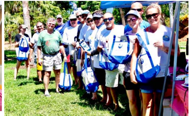
All the boat captains line up with their goodie bags. Inside the bags they found lots of Starbrite boat cleaning products. Boats in Lauderdale Isles will be the cleanest watercraft in South Florida.