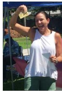
OK, OK, so it's only Monopoly money...but it's still a hundred bucks.