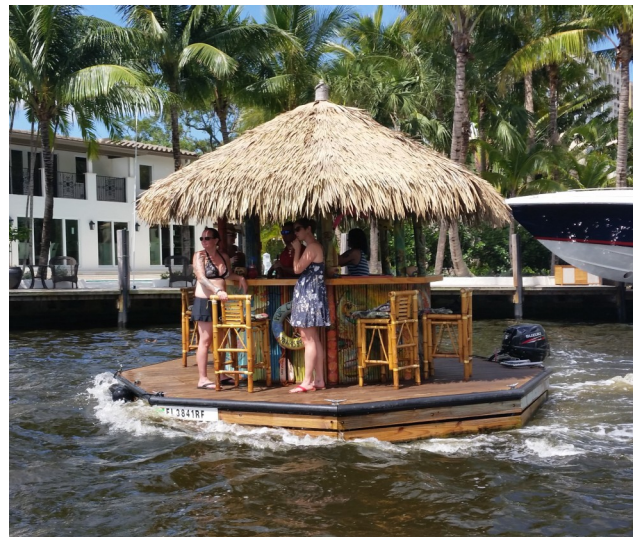
Only in Fort Lauderdale. As seen on our local waterways!

Let's be perfectly clear - LICIA knows the problem properties and we watch them closely. We want each and every neighbor to be aware there is no harm in reporting to Code any activities that are not in compliance with City Ordinances and if you are either fearful or worried let a director know. We have tough skin and we engage Code on a regular basis. Our goal is to work diligently for our neighborhood along with Code and City officials on each and every neighbors behalf.