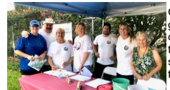
Our great crew at the sign-in table.