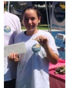
Unique find: The skull and upper jaw of the very rare New River "ANAUGI," a reptile that roamed this area millions of years ago. Sent to the Smithsonian for analysis.