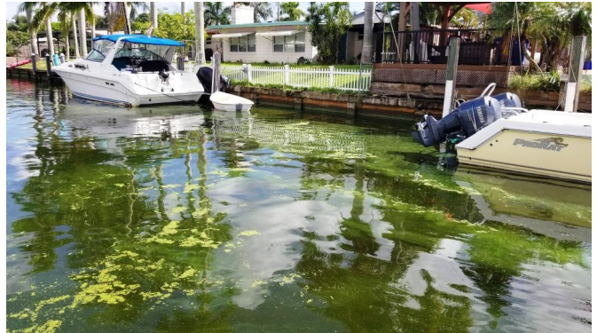
Duckweed and blue-green algae, Cobia Canal, Sept. 29th

LAUDERDALE ISLES WATER MANAGEMENT DISTRICT www.liwmd.org