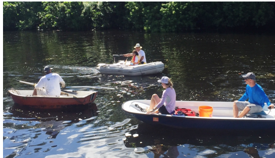
The fleet heads out