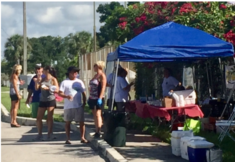
The registration booth offered breakfast snacks

The Lauderdale Isles September Waterway Cleanup is sponsored by The Lauderdale Isles Water Management District, The Lauderdale Isles Civic Improvement Association, & The City of Fort Lauderdale Parks & Recreation Department