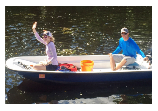
The fleet starts to return with all the trash found in the river and canals.