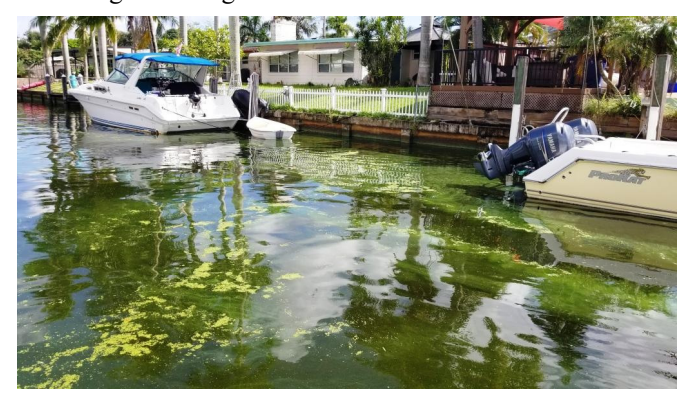
Duckweed and blue-green algae, Cobia Canal, Sept. 29th

the same nutrients. Plus, lawn debris blown into the canals by lawn service workers contributes to it as well. This is not the first time we've had algae blooms; we had significant blooms in 2013. The blue-green algae lives in fresh to brackish water, and is <u>NOT</u> the same algae causing the red tides on the beaches.