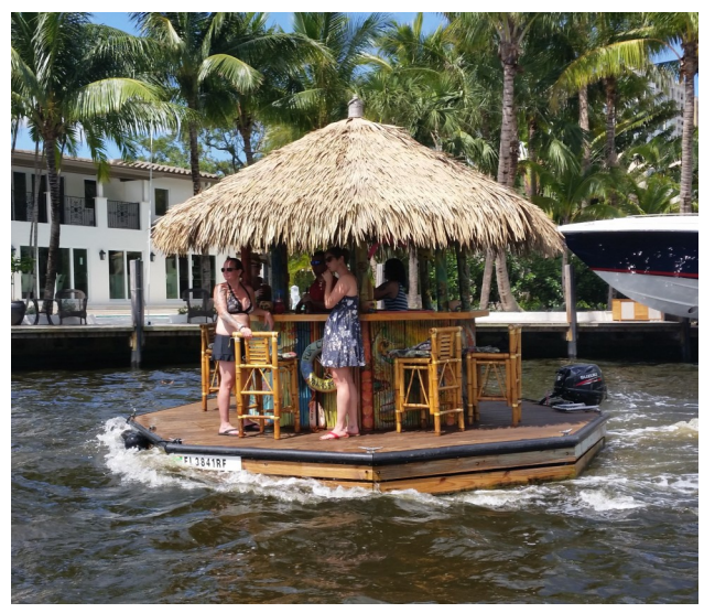
Only in Fort Lauderdale. As seen on our local waterways!

Let's be perfectly clear - LICIA knows the problem properties and we watch them closely. We want each and every neighbor to be aware there is no harm in reporting to Code any activities that are not in compliance with City Ordinances and if you are either fearful or worried let a director know. We have tough skin and we engage Code on a regular basis. Our goal is to work diligently for our neighborhood along with Code and City officials on each and every neighbors behalf.