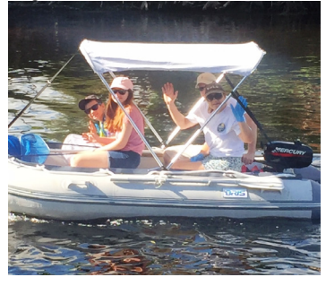
The Prizlees head to their assigned canal