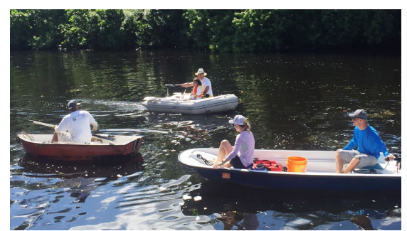
The fleet heads out