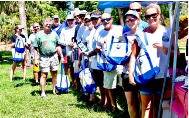
All the boat captains line up with their goodie bags. Inside the bags they found lots of Starbrite boat cleaning products. Boats in Lauderdale Isles will be the cleanest watercraft in South Florida.