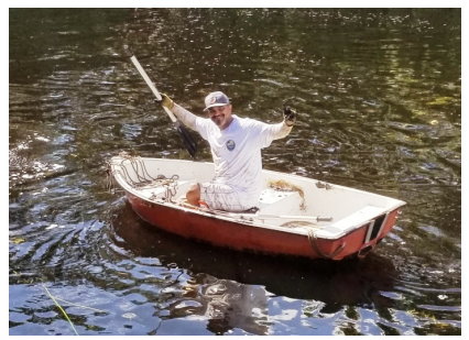
Who needs an outboard motor? Not Rey.