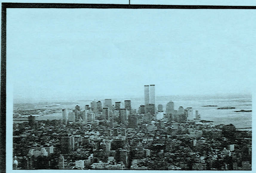
Picture was taken June 4th,2001 from the Empire State Buiding.