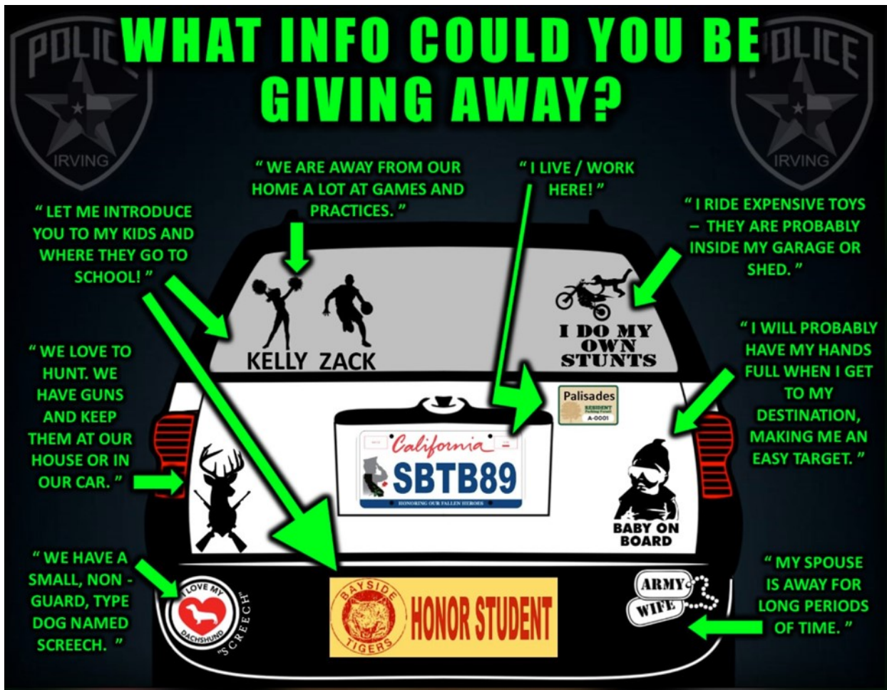
Image from the Irving Police Department's Facebook page posted on July 21, 2020.