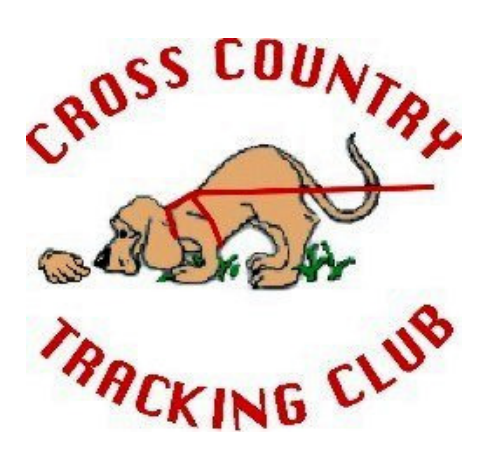
April 2020—Aug. 2020