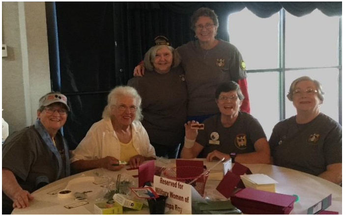
MilWomen of Tampa Bay card crafting team.

Though, the event did not meet the goal number of cards, it was a good time for everyone and a large number of cards will be sent to military members overseas so they have holiday cards to mail home.