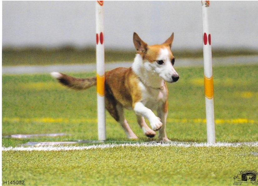
MACH 5 Ketka's Private Jett BN RAE2 MXS2 MJG2 OF T2B2 SCN SIN SBN CGC TKA Birthday: July 2, 2008 (almost 13 years old) Owned and loved by Linda Raphael