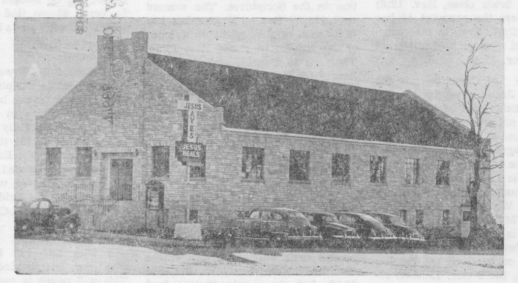
ENROLLMENT DATE SEPTEMBER 3, 1968