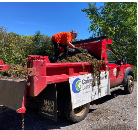
Many hands make light(er) work! Thank you to all the CGLT members and Rochdale residents who helped pull a full dump truck and trailer load of invasive water chestnut and milfoil pond weeds from Greenville Pond in Rochdale.