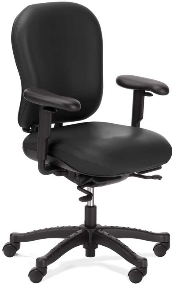
RPM Advanced Control Task Chair in Spinneybeck Verona Leather