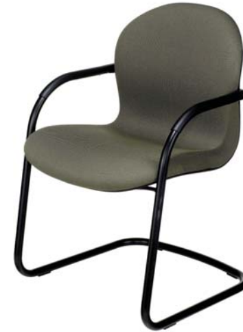
RPM Side Chair in RPM Knit Radial, Basil/Xanadu