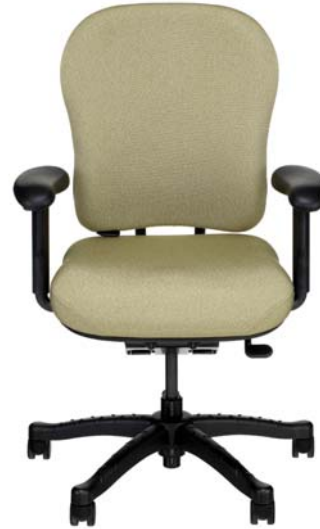
RPM Basic Control Task Chair in KnollTextiles Chroma, Lichen