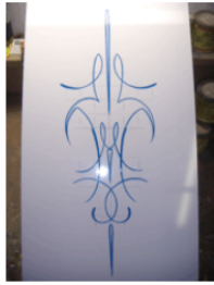
Additional lines are added freehand. Allow blue pinstripping to dry slightly.