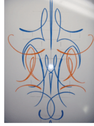
Additional orange lines added freehand.