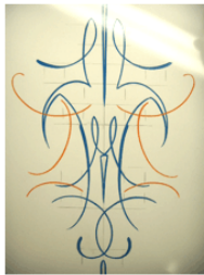
The guidelines are now striped with orange.