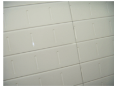
Align the reference points on the PerfectaStripe grid with the center line. Transfer desired vertical and horizontal lines with a marking pencil.