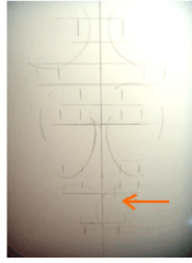
Transferred curves seen above. Notice the curves overlapping the center line. This is achieved by sliding the template left then right of center and transferring curves.