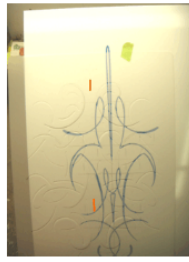
The template is reapplied upside down, in this case is aligned with grid marks left of center. Lines are transferred, then the template is moved to the same location right of center.