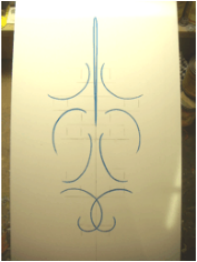
Using a pinstripping brush, a teardrop is applied, and only the transferred curves are painted.