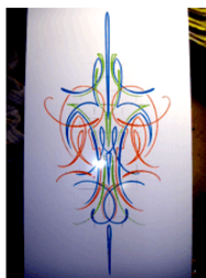
The finished design! Green pinstripping