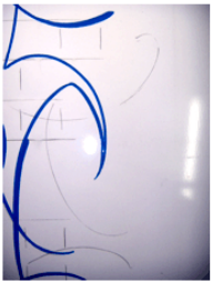
Close-up of curves transferred from template.