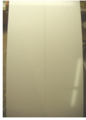
Measure and mark a vertical center line