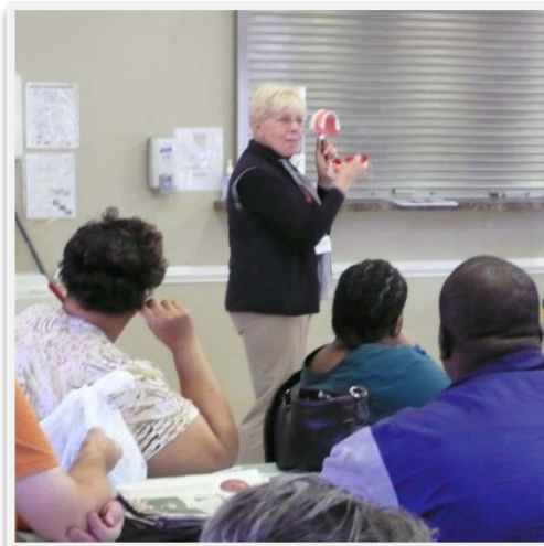
Dental Care Counseling Sessions