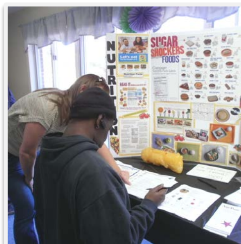
Diet and Nutrition Education

CELEBRATING 34 YEARS OF PROVIDING MENTAL HEALTH SUPPORT SERVICES!