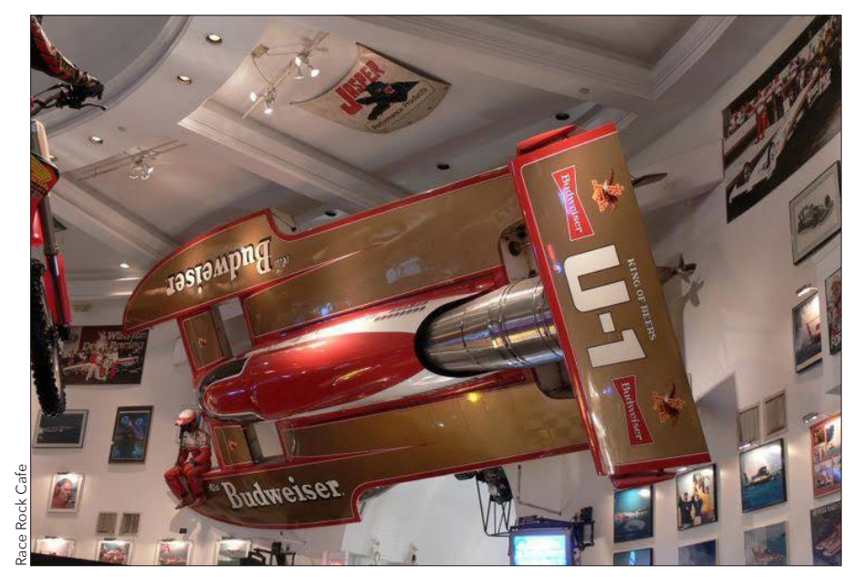
THE T-1 : [Top] Before it was a Budweiser , the boat first appeared in 1984 as the Lite All Star . [Middle] During a test run as the Budweiser in 1985. [Above] The hull hanging from the ceiling of the Race Rock Cafe in Orlando, Florida.

unique handling and turning characteristics.