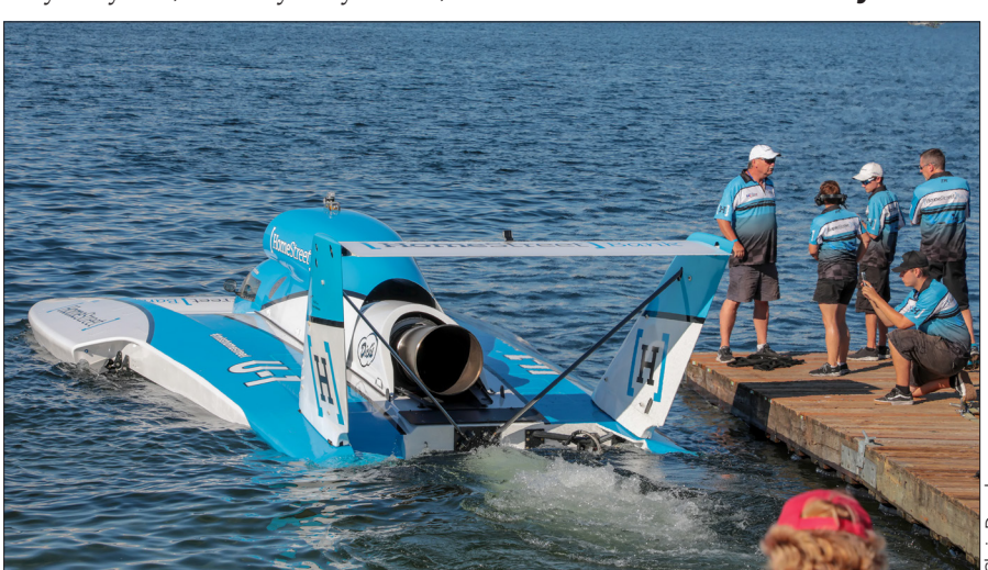
The new Miss HomeStreet leaves the dock in Seattle.