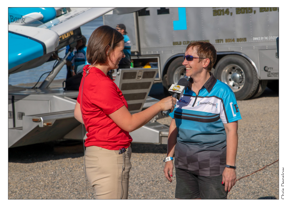
Being the sport's first woman crew chief in the turbine era brought its share of attention from the media.

I would look over at the other boat and it's sittin' there, kinda sideby-side. But I had to get the other boat ready, the old boat. I wasn't really in on the build process as much with the news boat as I was with the 2007 hull. And, I guess that's why I still have an affinity for it. I still love that boat 'cause I really helped more on it than I did on the new boat. However, when you put the new boat in the water in Tri-Cities, and she's not totally race-