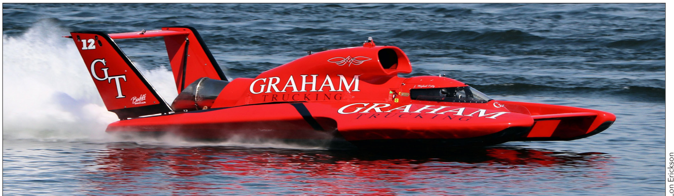
THE T-6: The last of the turbine Budweisers as it leaves the dock for a test run in Seattle in 2000. [Upper Middle] The T-6 was parked next to its sister, the T-5, at every race. Can you tell the difference between the two? [Lower Middle] Racing as the Valken.com while at Madison in 2011. [Above] The T-6 hull currently competes as the U-12 Graham Trucking.