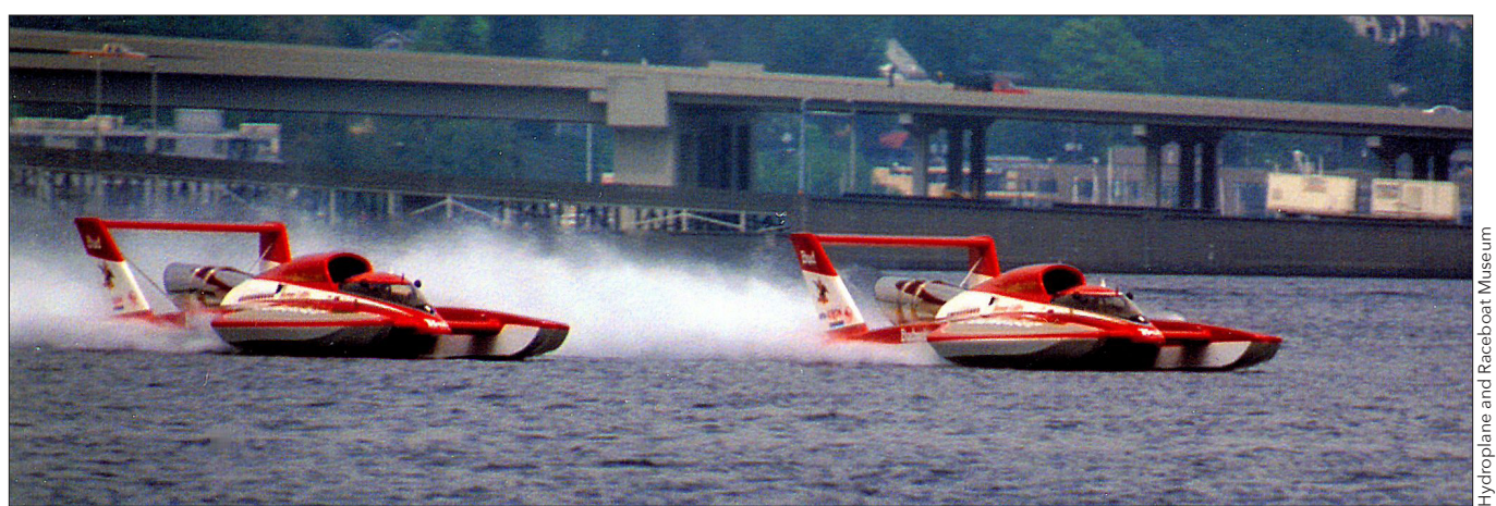
THE T-2: [Top] The Budweiser made its debut at Miami in 1987. [Middle] The T-2 as it currently looks, doing display work in Florida. [Above] The T-2 Budweiser runs with its new sister, the T-3, when the latter was launched at Seattle in 1989.