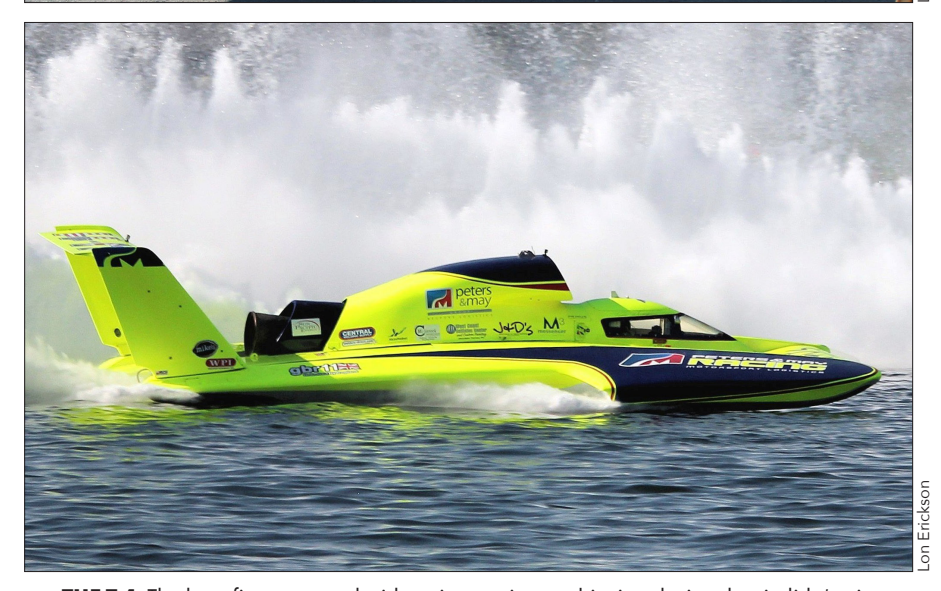
THE T-4 : The boat first appeared with an innovative, multi-wing design, but it didn't win any races and Bernie Little soon gave up on the project. [Middle] The hull was sold to Bill Wurster in 2002 and raced as the LLumar Window Film , among other names. [Above] The boat when it competed as the Peters & May in 2016.