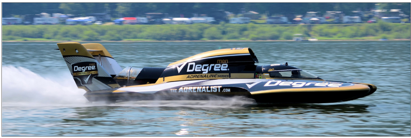
THE T-3 : [Top] The third turbine Budweiser racing in 1989. [Upper Middle] The boat when it appeared in the Tri-Cities as Hoss Mortgage in 2007. [Lower Middle] The boat as it appeared most recently. [Above] The boat raced as Degree Men in 2012.

The T-5 hull first raced in 1996 then was extensively rebuilt the following year, so it goes by two