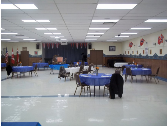
Above: Set up before the dinner. Looks a little less crowded doesn't it!