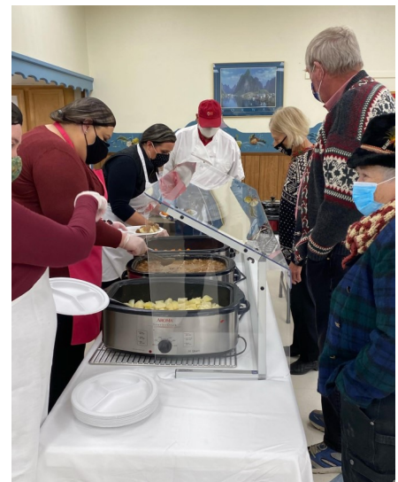
Above and below the Serving Setups for the 2020 COVID-19 Lutfisk Dinner!