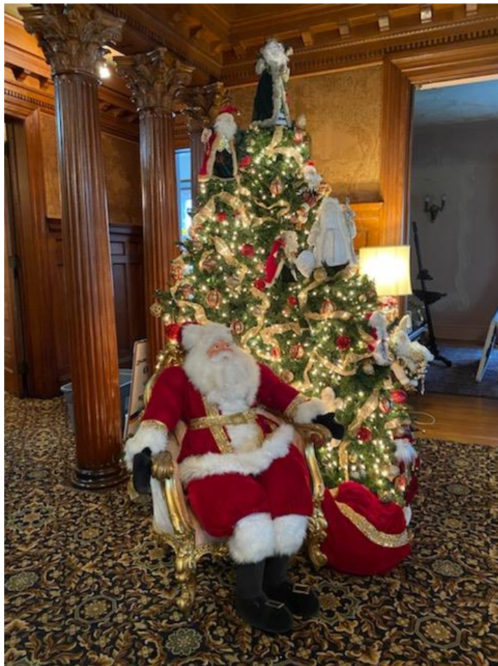
Magic at the Mansion - 2020

May your holidays be blessed, and I will see you at the Club on Dec. 9 either by Video Conference or in person. Please do RSVP for a seat for the meeting AND to stay for lunch or get a lunch to go.