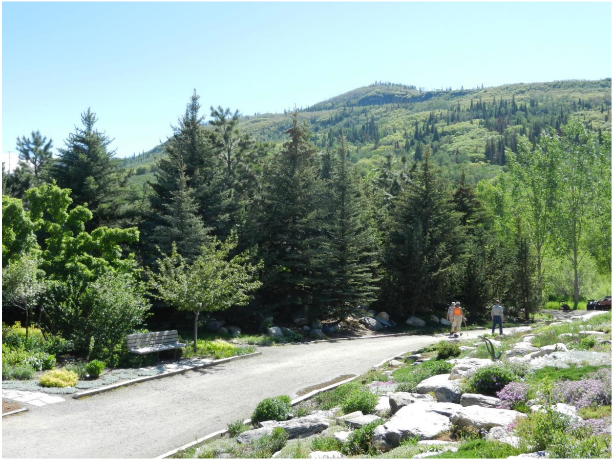
Steamboat Springs Botanical Gardens