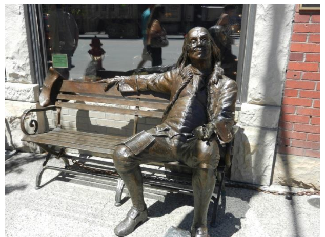
Ben Franklin Statue Downtown

The Steamboat Grand offers a free guest shuttle to Downtown Steamboat Springs. It departs from the front of the hotel at 15 and 45 minutes past the hour. Check with the front desk for operating hours each day. This is a convenient option for going downtown without parking hassles.