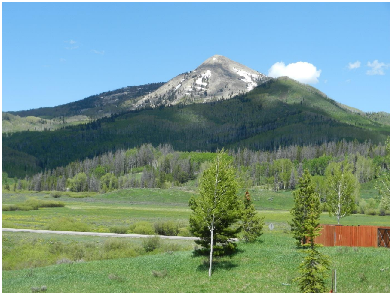
Hahns Peak Near Steamboat Lake