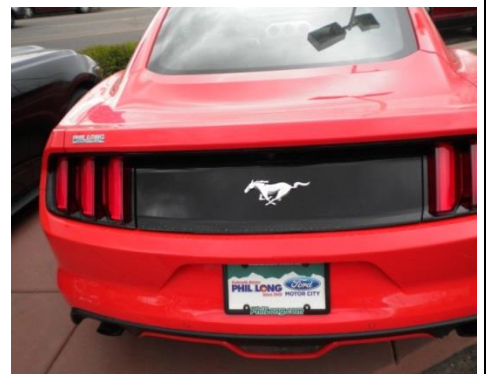
4 Cylinder Mustang