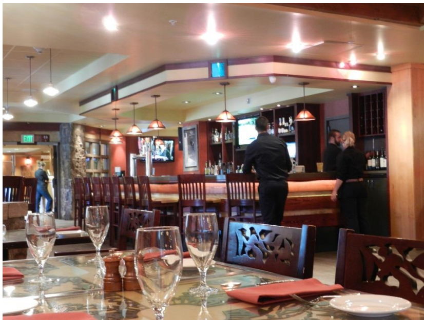
The Cabin Restaurant at the Steamboat Grand

The Steamboat Grand has a main restaurant called The Cabin. This is a nice place with prices on the high side. The food is good, but has stiff competition from better fare in town. The Cabin has a daily Happy Hour from 4:00-6:00 PM with half price draft beers and wine. There is also a coffee shop with quick-service counter food and a bar and grill at the pool area.