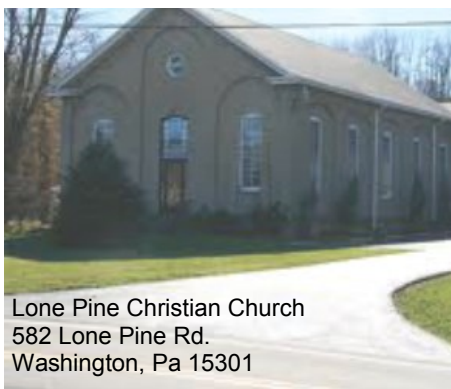
Lone Pine Christian Church 582 Lone Pine Rd. Washington, Pa 15301