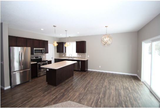
*SOME OPTIONS MAY BE SHOWN*