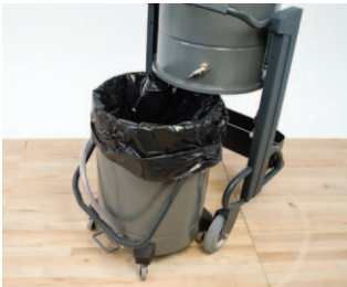
The easily-removable collection bin makes clean up easier than ever.

* All performance ratings are measured with both motors running concurrently. ** Waterlift is a performance rating and is not an indicator. This is a dry vacuum only. Specifications are subject to change without notice.