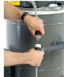
Cord twist lock for easy transportation.