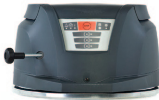
Sealed control panel to keep dust out and away from the electronics. Ergonomic side shaker for easy on-the-go dust removal from the primary filter.