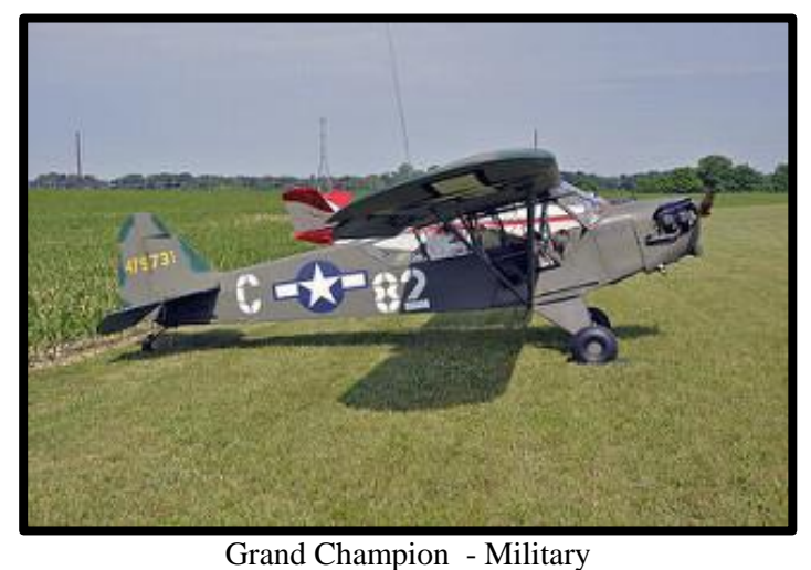
1944 Piper L-4