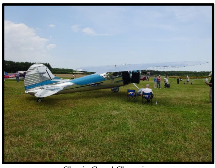
Classic Grand Champion