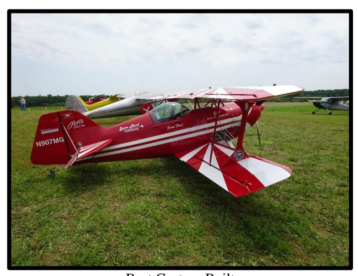
1999 Pitts S1S