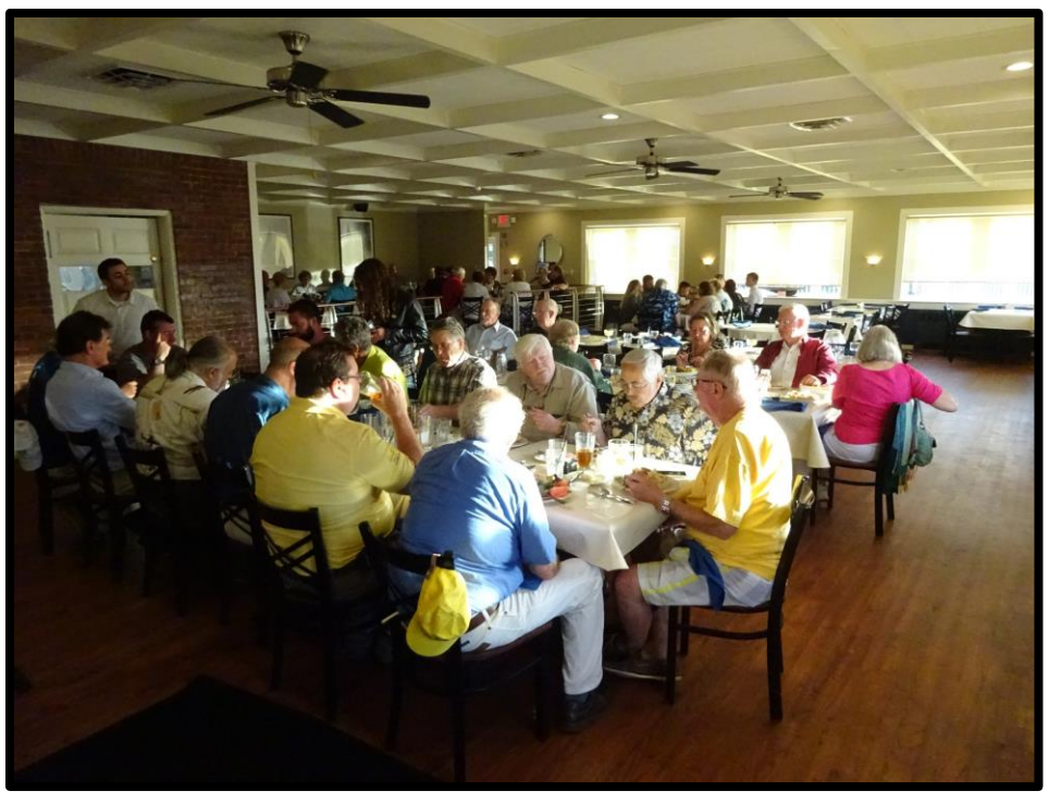
2016 Pre-Fly-In dinner at the Kitty Knight House.