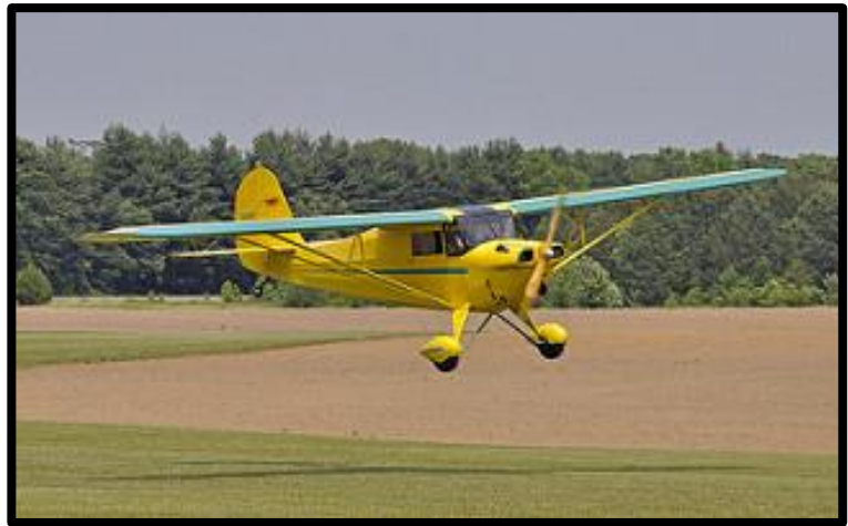
Antique Grand Champion

Yeah, most of us can't stop calling it by the "H" place, but the move to Massey was an instant success. Not only was the set-up easier, 77 planes arrived, on a weekend where two other fly-ins, including one specifically for antiques, were being held. In addition to conducive weather and some very nice plane turnout, the really noticeable difference was in the increased participation by the general public. Here's hoping it just gets even better next year.