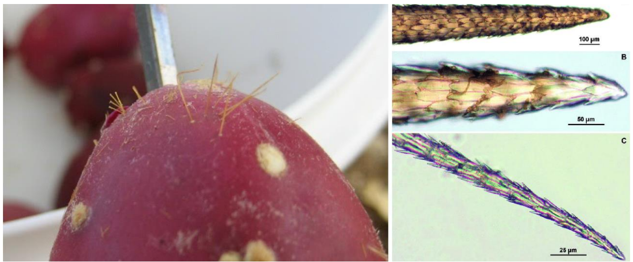
It's the tiny, almost invisible, spines that are most irritating. They can be removed by duct tape (always keep some in your in your emergency kit!) or by laser ablation in the food industry

Besides, I had the pleasure of singeing the tunas over a flame to remove the nasty little "prickles" that lie in wait on the surface of the fruits. (After removing a few from my hands with duct tape and tweezers, that is!). The prickles, technically called glochids , are barelyvisible until they spark, ignite, and glow like tiny filaments only to disappear an instant later. If you look for recipes for Fire Cider that include prickly pear tunas, I guarantee you won't find any, but they seemed like just the thing for my Hill Country-inspired Fire Cider!