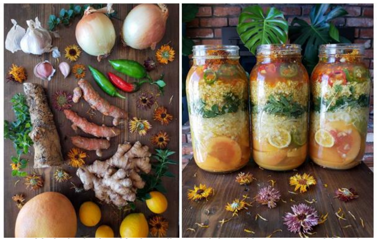
Start with the basic Fire Cider ingredients and then add your own special touches!

I had never made Fire Cider before, but, with flu season upon us and the ongoing COVID-19 pandemic to contend with, it seemed the perfect time to make a batch. Many believe that the regular consumption of this vinegar-based herbal elixir enhances immune function and either prevents, or reduces the severity and duration of respiratory infections. And while this claim has never been subjected to a scientific examination, Fire Cider does contain ingredients such as ginger, garlic, onions, turmeric, and horseradish that are known to fight infection, reduce inflammation, and relieve congestion.