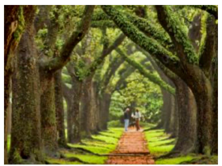
Root flares along Boulevard Oaks, South Blvd. 2020.

Arboretum Mulch," you will become a mulch expert in two minutes. Also, google Howard Garrett, aka "The Dirt Doctor," to see him narrate a slide show about improper volcano mulching and planting depth of trees. Guess which city he proclaims as the worst in the world for tree maintenance and preservation? Sad but true. Trees are incredibly valuable to our landscape and our future.