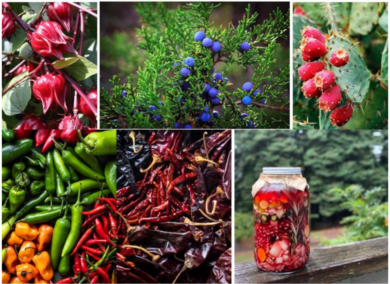
These pictures convey some of the vibrant Hill Country Christmas colors

Here and there bright Christmas colors decorated the winter landscape of subdued tans and grays. Maybe not as traditional as the old holly tree in my childhood front yard, but Christmas red and green made its appearance nonetheless - in the prickly pear fruits that escaped being eaten by the deer and in the fiery chili peppers gathered just before the first freeze. And while I was accustomed to the forests of Douglas fir "back home", the prolific cedars provided the evergreen promise of continued life throughout the winter season. Clusters of mistletoe added a splash of green to the highest branches of the leafless old oaks, and festoons of "old man's beard" decorated the gnarled limbs like the tinsel on my childhood Christmas trees.