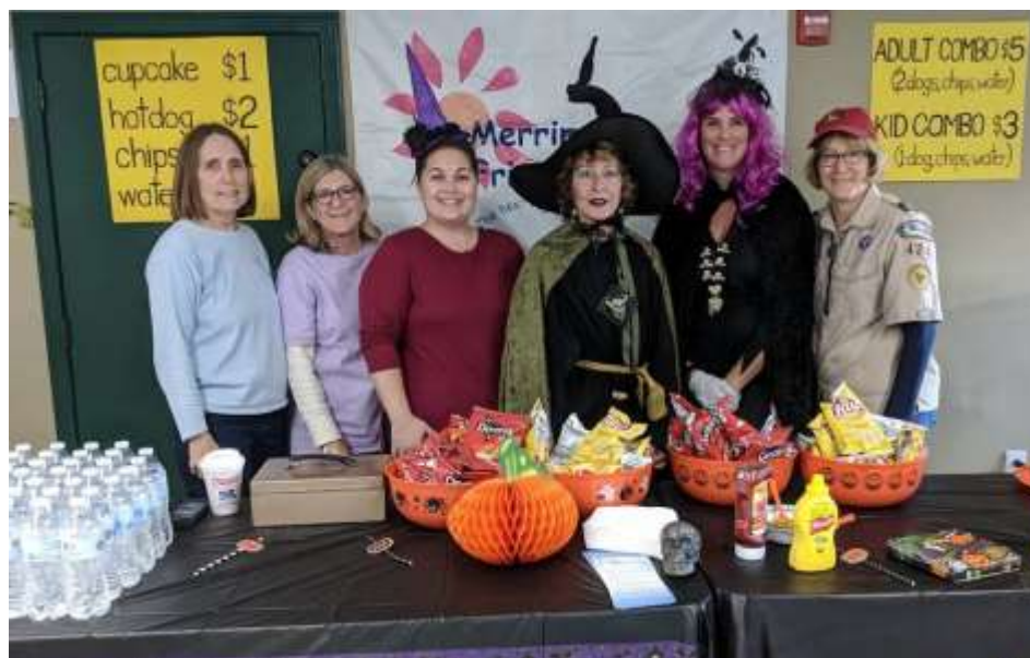
Town Halloween Party at Wasserman Park

interestgroups@merrimackfriendsfamilies.org