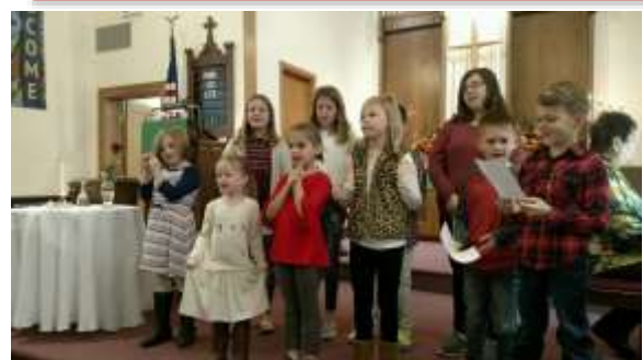
Children's Veterans Day Tribute November 10th