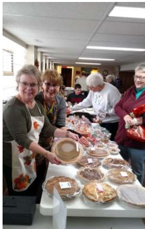
Holiday Pie Sale & Chili Dinner November 10 th