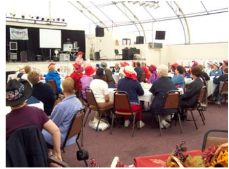
Ladies attending the Monaco America Hatter's Tea