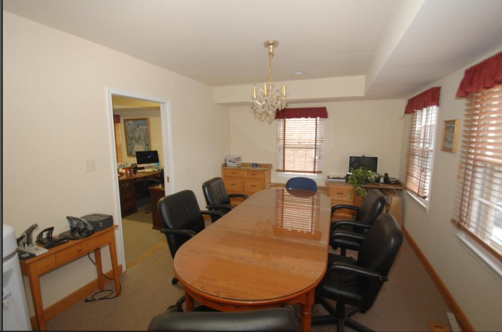
Main Level Conference Room