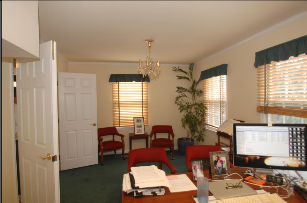
Executive Office Upper Level North