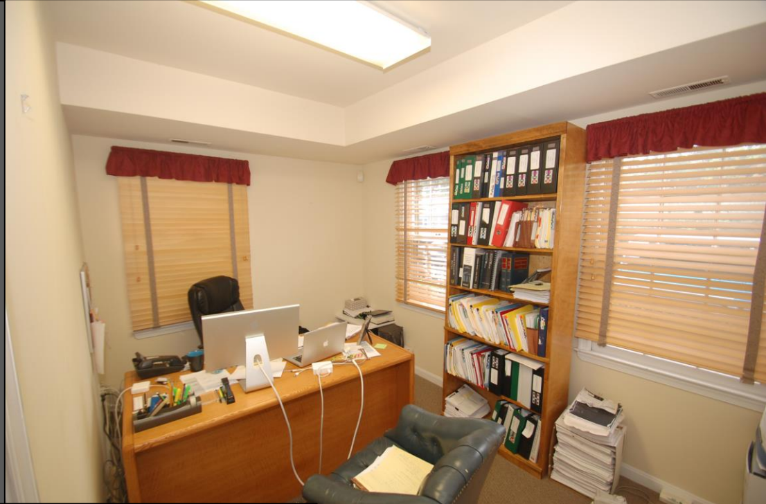
Office Lower Level Walk-out

This level also contains ample file storage, work space and copy center