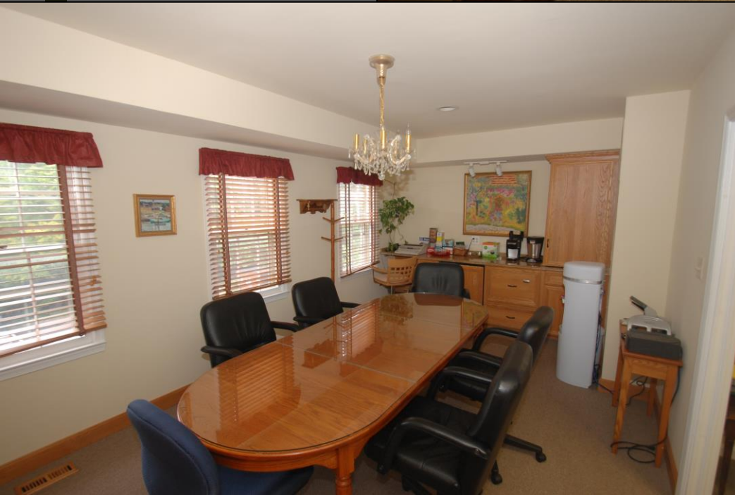
Main Level Conference Room Built-Ins Coffee Station