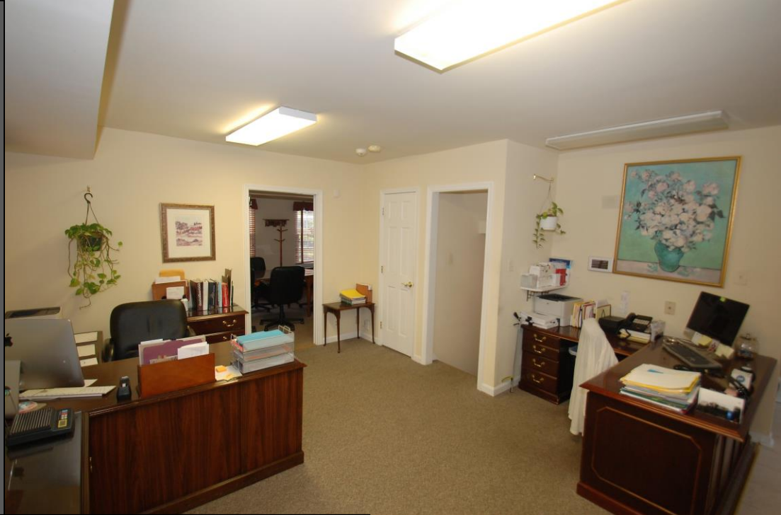
End Unit Receives daylight In all Offices