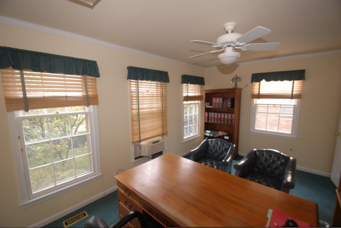
Executive Office Second Floor south