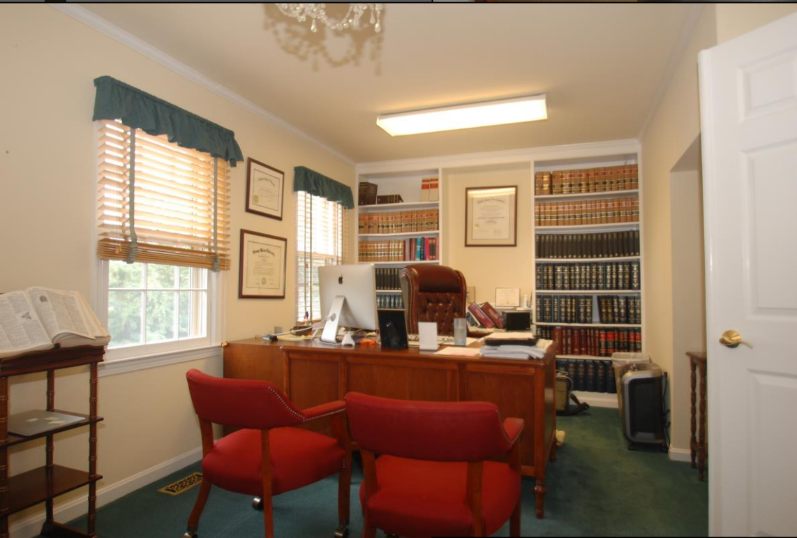
Executive Office Upper Level North Built-Ins