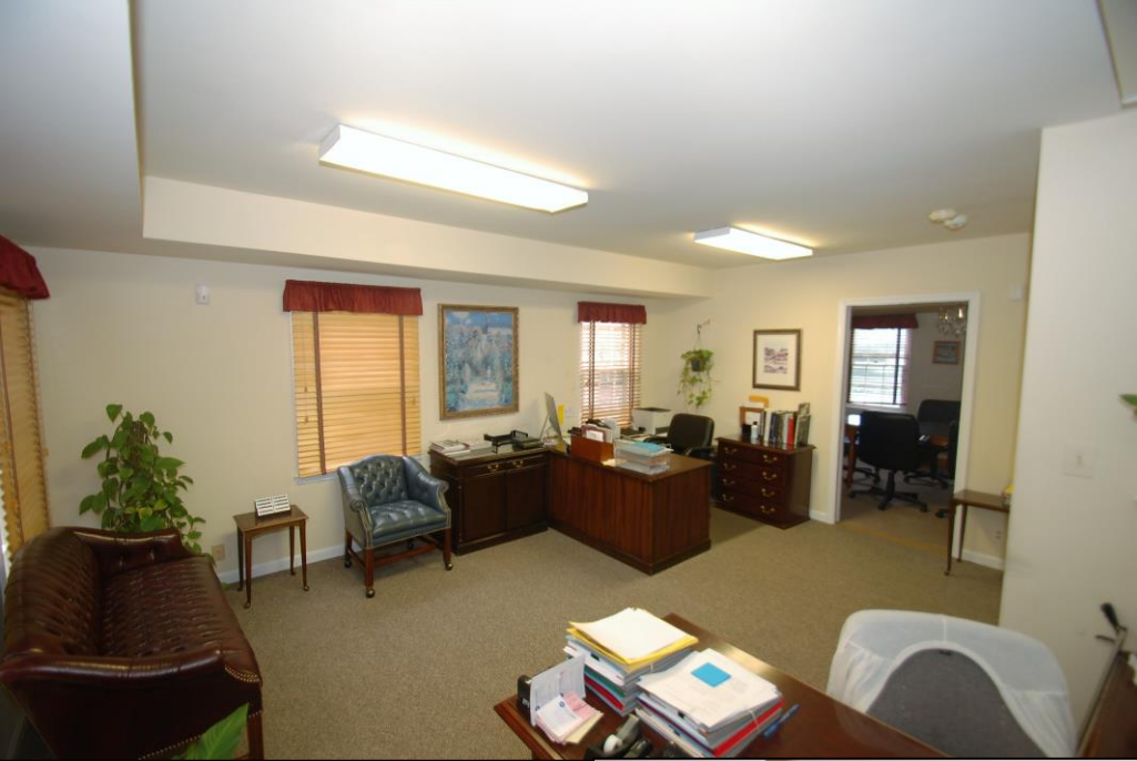
Main Level Reception, Clerical Waiting Room