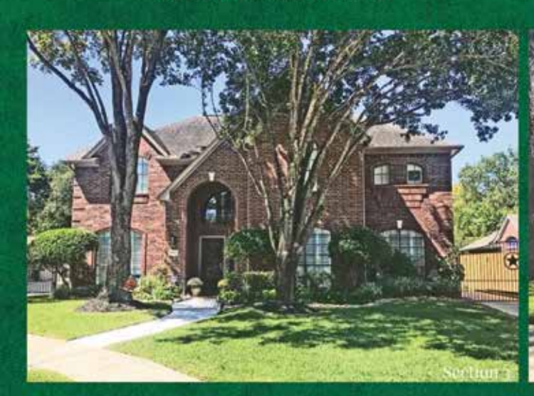
7611 Crescendo Court