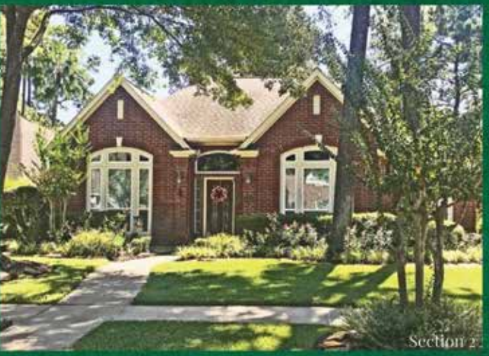
9007 Rhapsody Lane