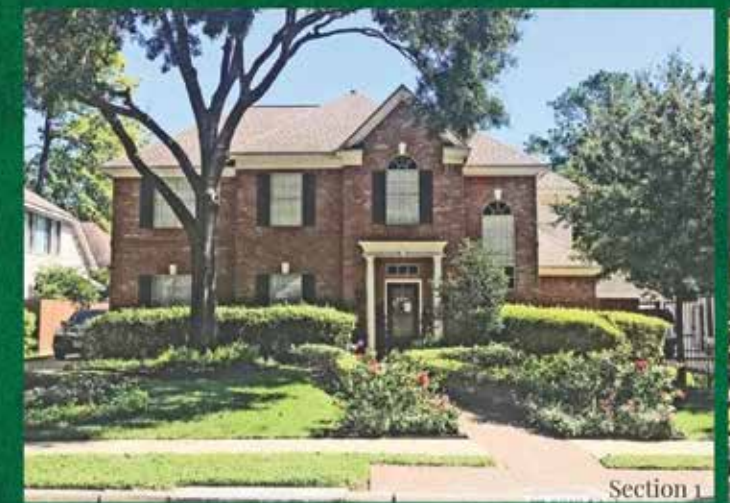
8010 Sonata Court