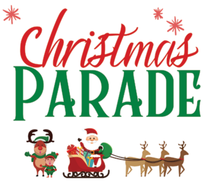
Everybody loves a parade. So, let's have one!